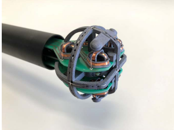
Test probe, without the casing