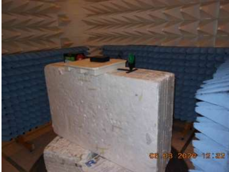
Above 1GHz with Antenna Port Filled