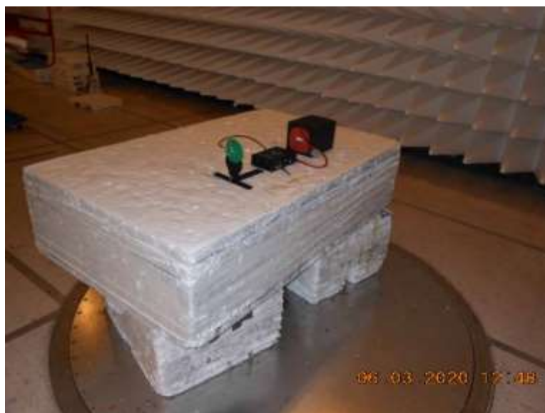
Below 1GHz with Antenna Port Filled