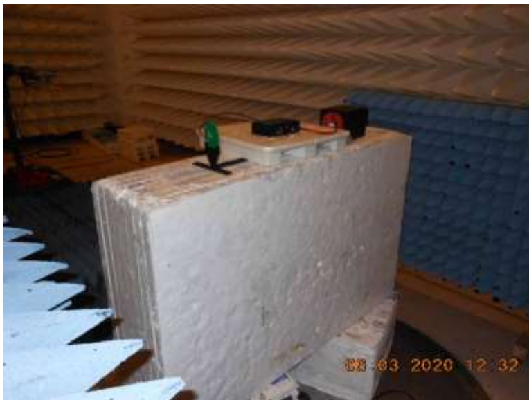
Above 1GHz with Antenna Port Filled