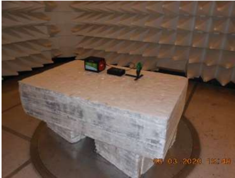
Below 1GHz with Antenna Port Filled