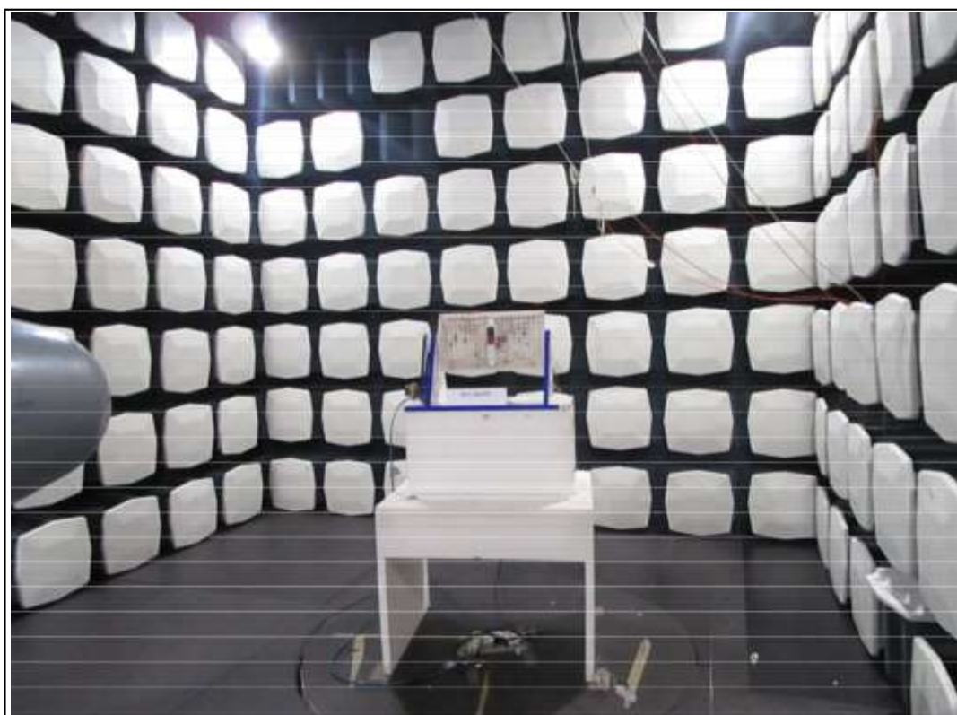
Photograph 4: Radiated measurements test set-up above 1 GHz, over view