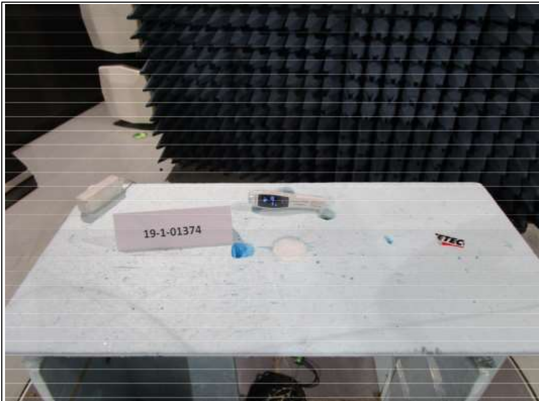
Photograph 1: Radiated measurements test set-up below 1 GHz, close up view