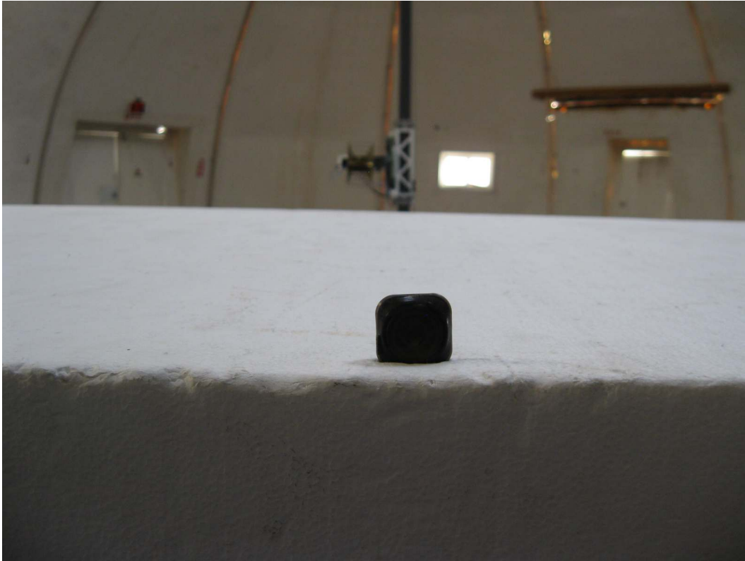
Figure 4 - Close up of Sensor on table (battery operated)

Close up of sensor. Same positioning used for both 30 to 1000MHz (80 cm table) and 1 to 25GHz (150cm table). Sensor powered by a fresh coin cell battery.