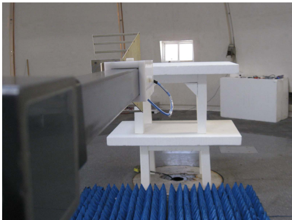
Figure 2 - Radiated Emissions above 1GHz