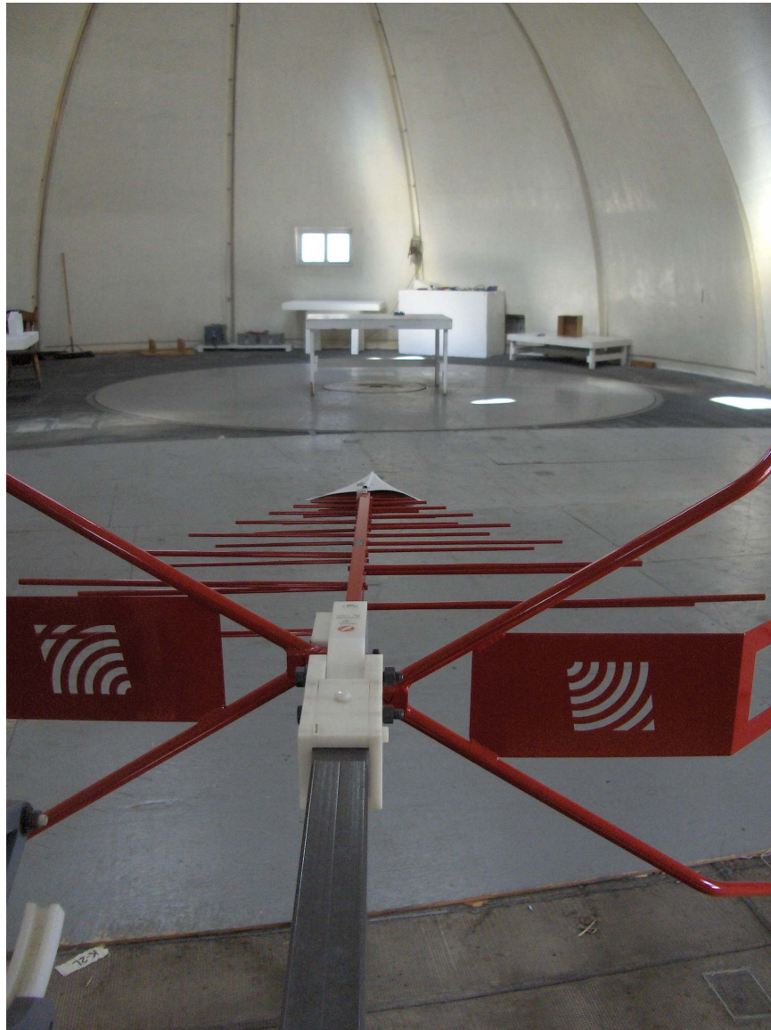
Figure 3 - Radiated Emissions below 1GHz