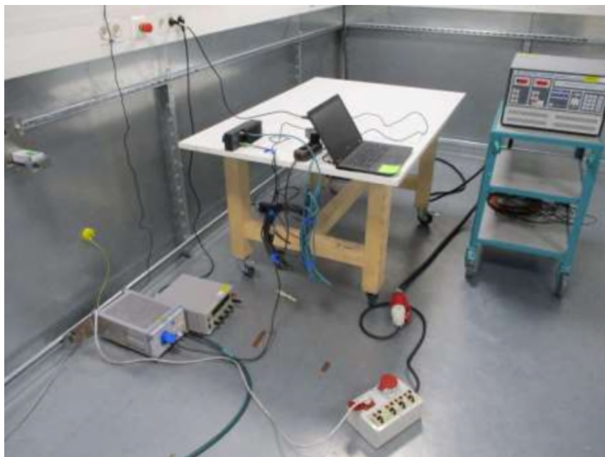
Figure 3 – Conducted emission