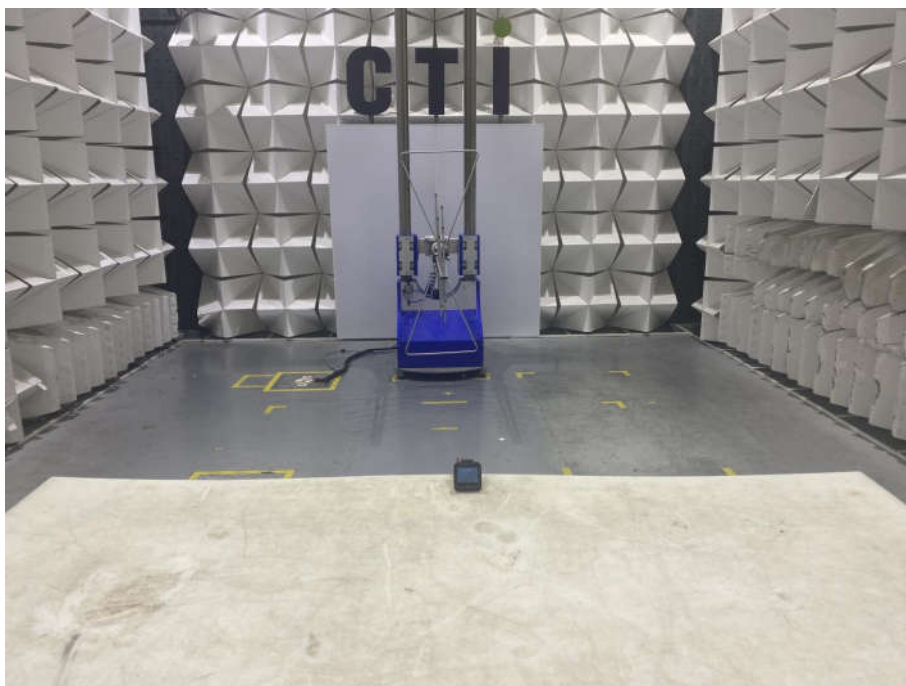
Radiated spurious emission Test Setup-2(Below 1GHz)