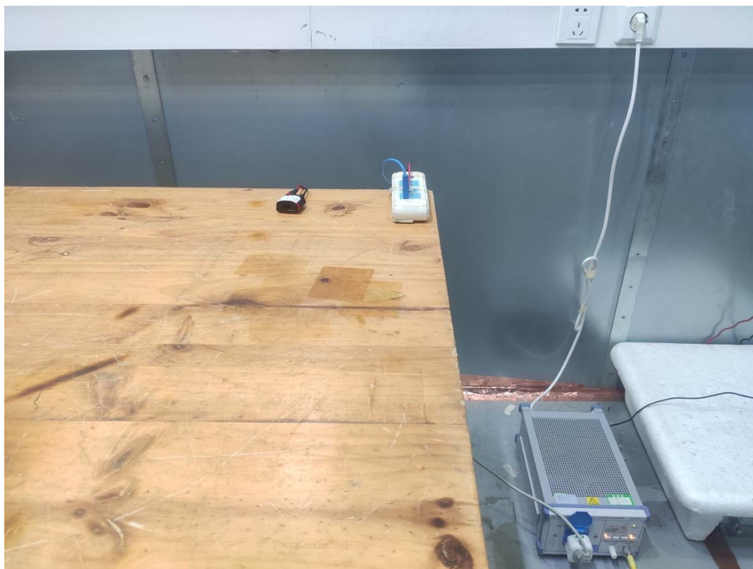
Picture2: Conducted Emissions Test Setup