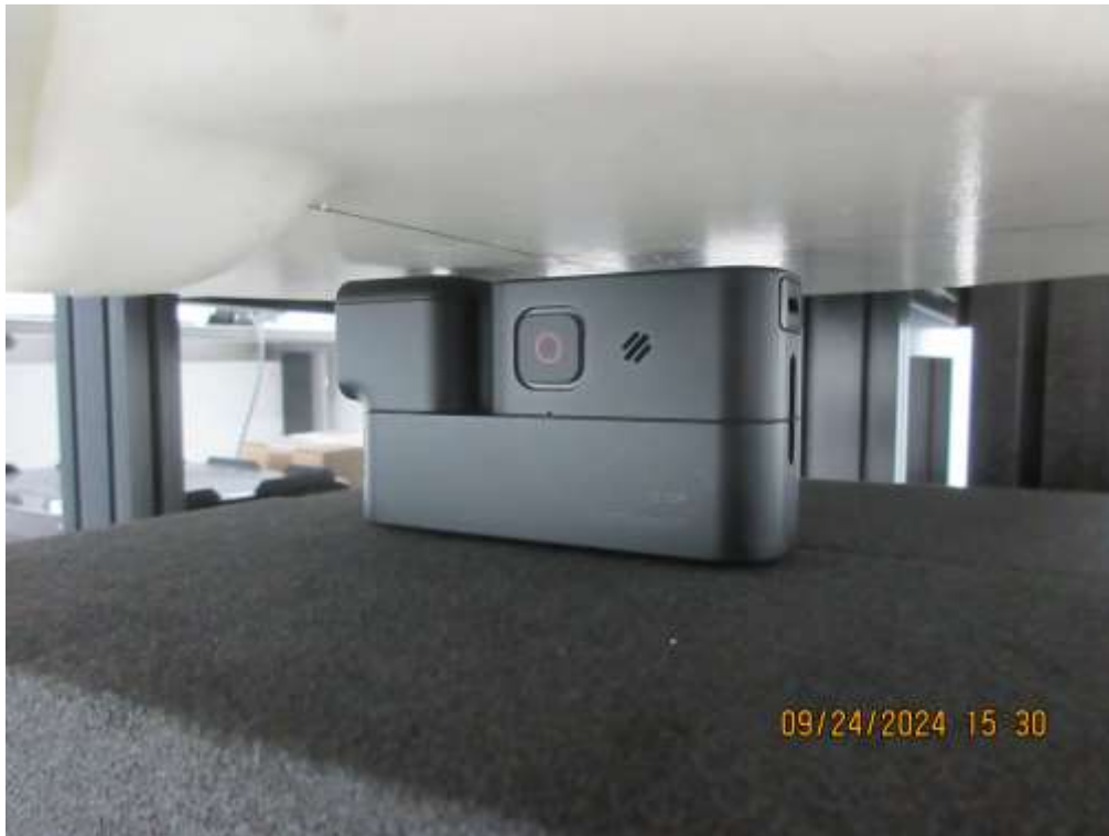
Top from SAM Phantom (Separation Distance: 0.5 cm)