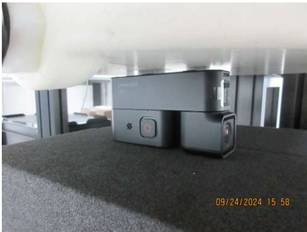
Bottom from SAM Phantom (Separation Distance: 0.5 cm)