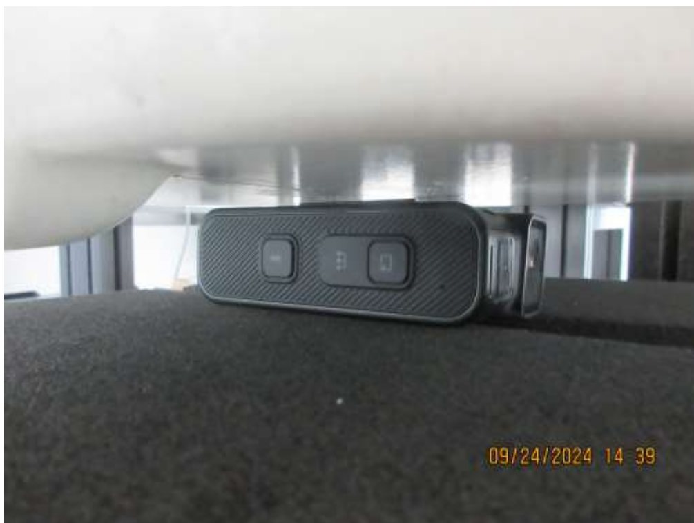
Rear from SAM Phantom (Separation Distance: 0.5 cm)

This Report is not correlated with the authentication of KOLAS.