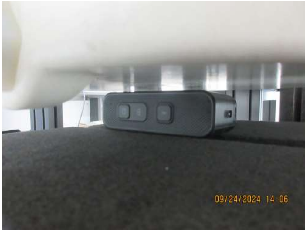
Front from SAM Phantom (Separation Distance: 0.5 cm)