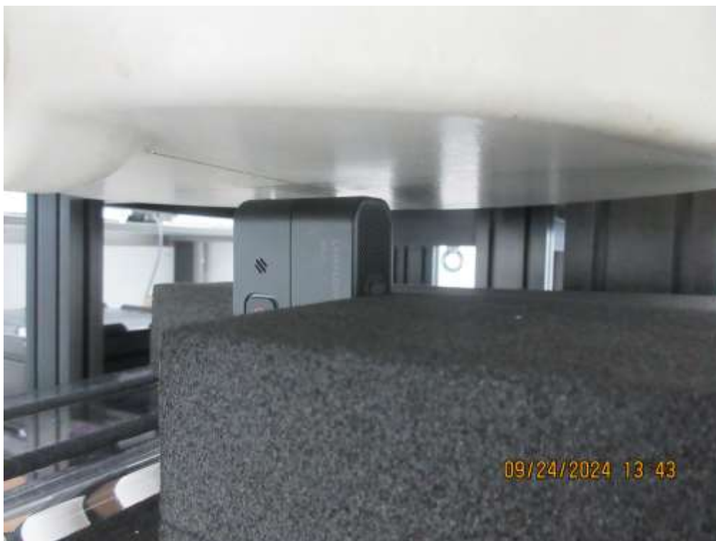
Right from SAM Phantom (Separation Distance: 0.5 cm)