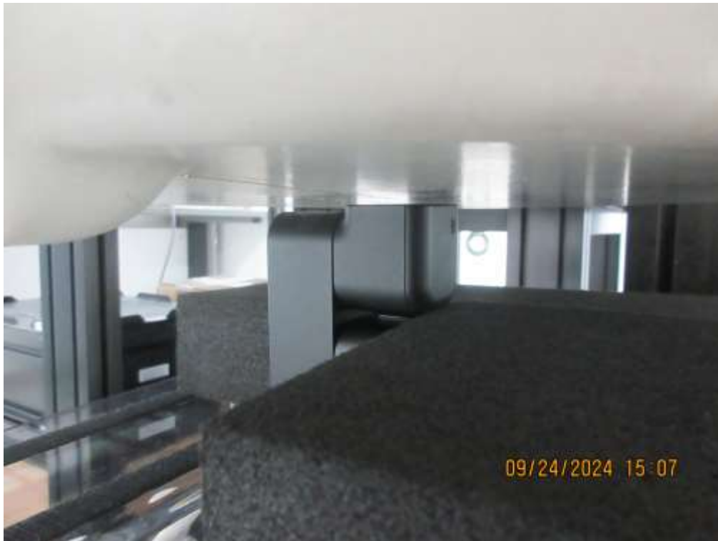
Left from SAM Phantom (Separation Distance: 0.5 cm)