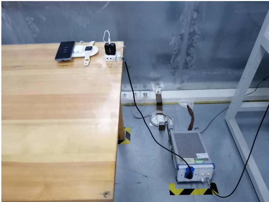
Conducted Emission-AC adapter charge mode