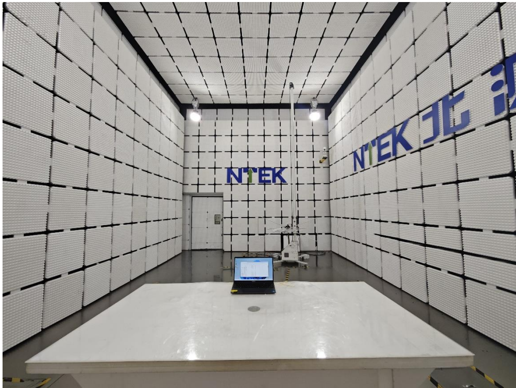
Radiated Measurement Photos