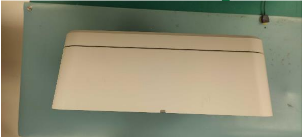
Figure 7: Top view