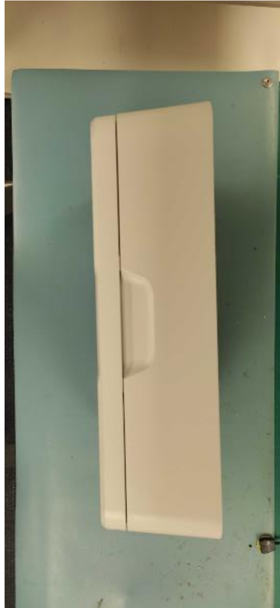
Figure 6: Right hand side of cabinet