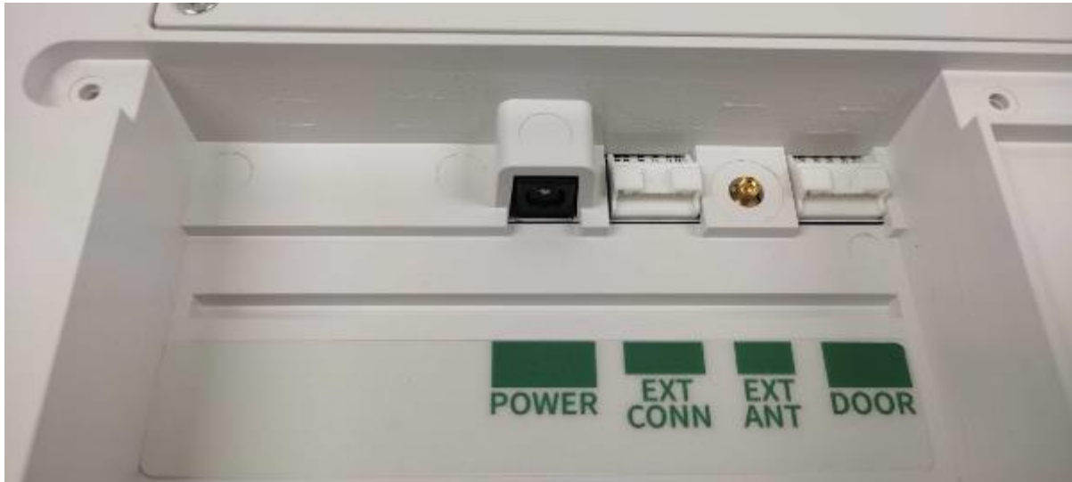
Figure 3: Close up of connectors at rear side of cabinet with Door cable removed.