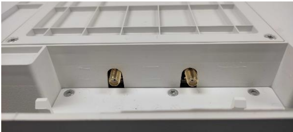
Figure 4: Close up antenna ports at the rear of the cabinet with LTE and Bluetooth antennas removed.