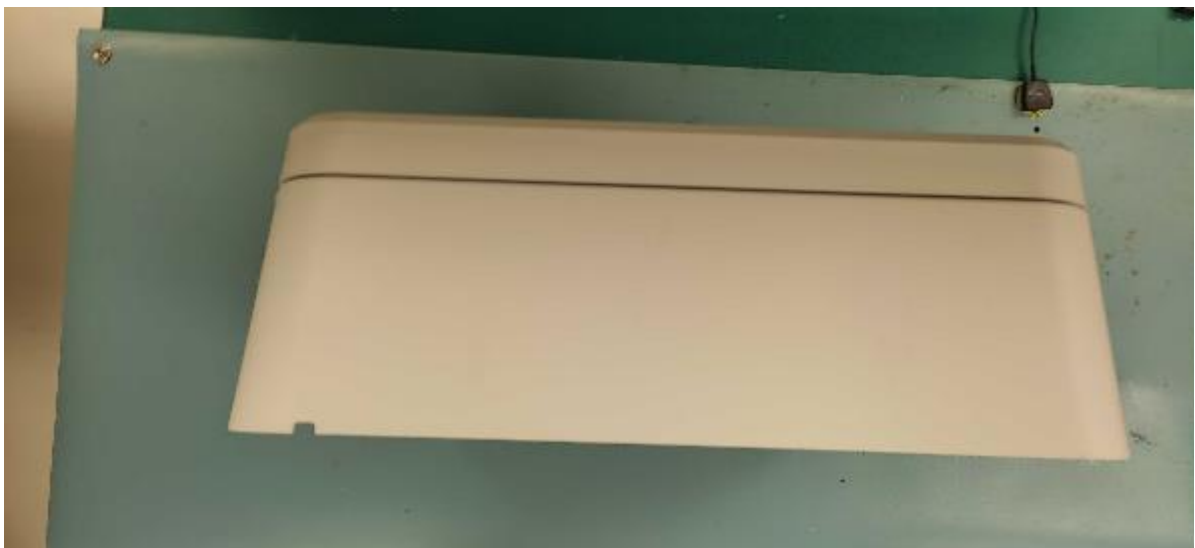
Figure 8: Bottom view