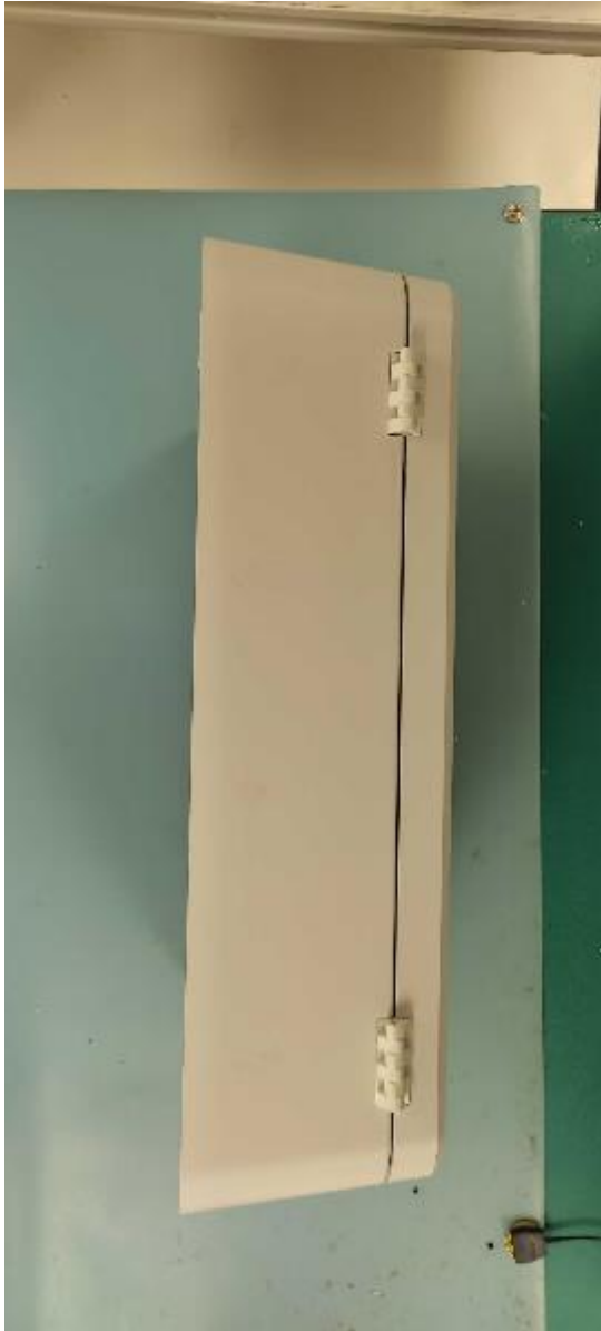
Figure 5: Left Hand side of cabinet