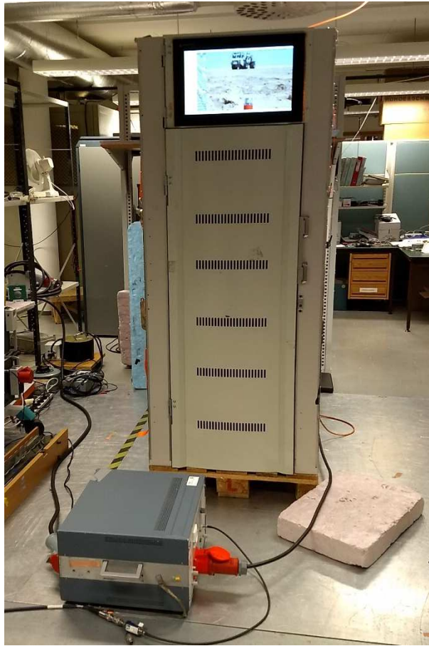
Test setup for conducted emissions measurement