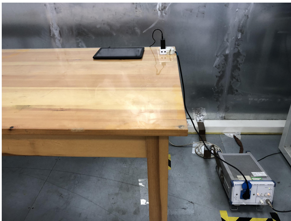
Power Line Conducted Emission