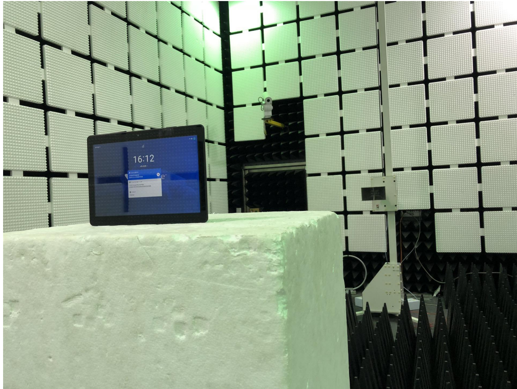
Radiated Emission Above 1 GHz