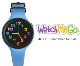
4G LTE Smartwatch for Kids

The safety solution designed just for kids to give parents peace of mind.