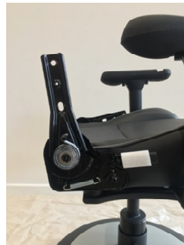
11. Align and screw the Right Hinge into bottom right side of Chair Seat