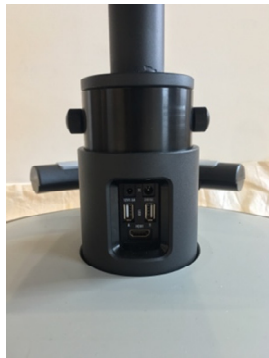
10. Align and screw the side bolts into the Central Tube and secure in place (tip: wiggle the chair slightly as you screw them in)