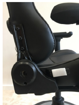
15. Screw the Bottom Right Hinge Cover into place (tip: the screw isn't very long, so please press firmly whilst doing so)