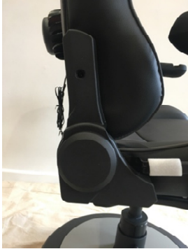
17. Screw Top Right Hinge Cover over Right Hinge