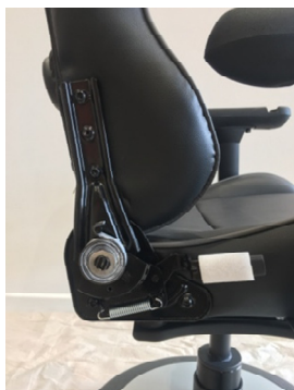
13. Screw the Right Hinge into the top right side of Chair Backrest