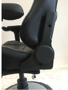
18. Screw Top Left Hinge Cover over Left Hinge