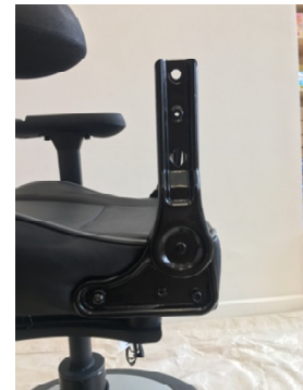
12. Align and screw Left Hinge into bottom left side of Chair Seat