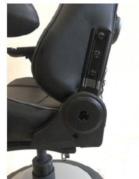
16. Screw the Bottom Left Hinge Cover into place (tip: the screw isn't very long, so please press firmly whilst doing so)