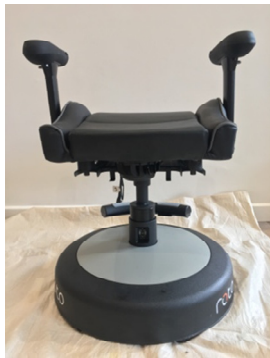
9. Place the Seat into the Base Central Tube

TIP: aligning and screwing in the Left and Hinge can be a bit fiddly. We highly recommend two people to do this task. Also loosely screw in each of the 4 screws before tightening.