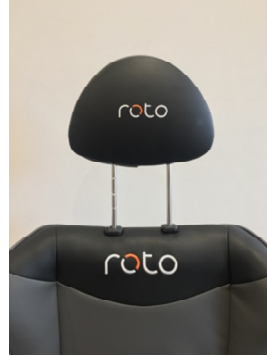
19. Push Headrest into the top of the Chair Backrest (tip: press and hold the button 'in' on the top of the chair whilst inserting the headrest)

WARNING: Any wired device must be connected through the stem and base of the Roto chair.