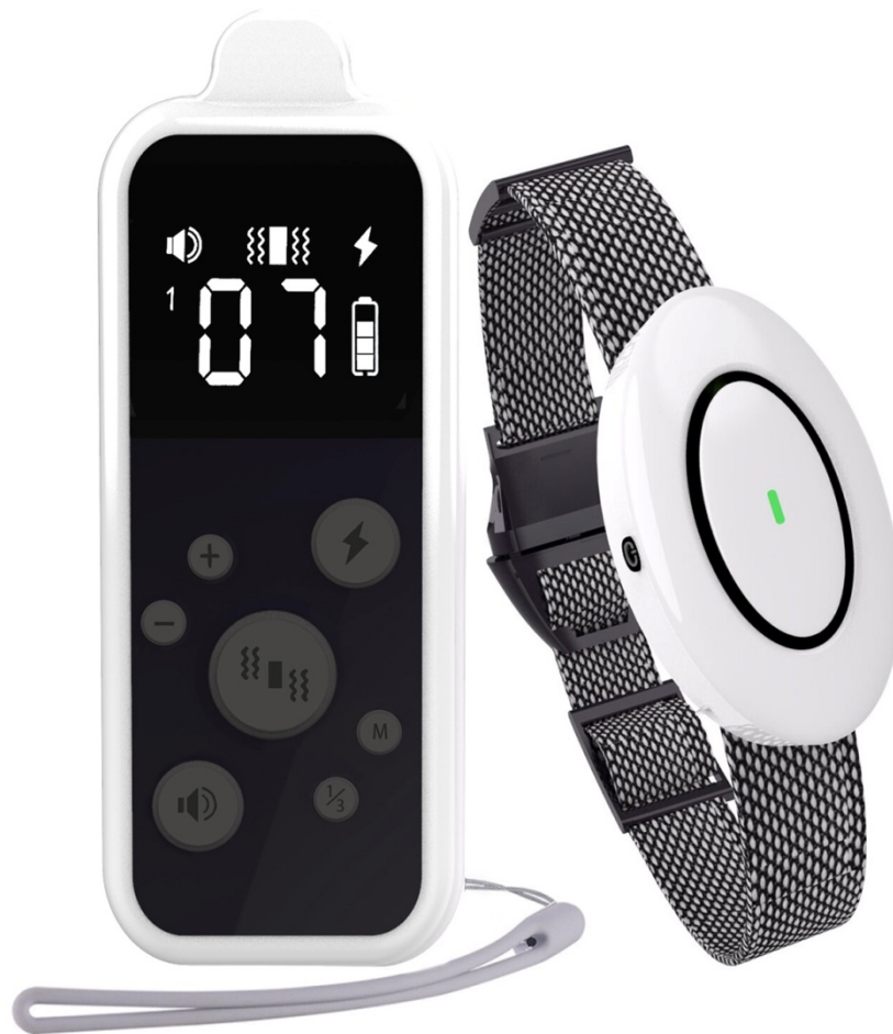
Dog Training Collar