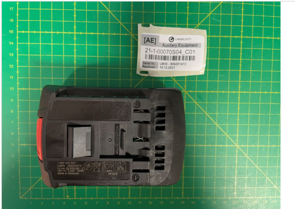
Photograph 3: AE1