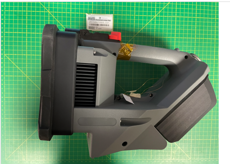
Photograph 2: EUT 1_left side view