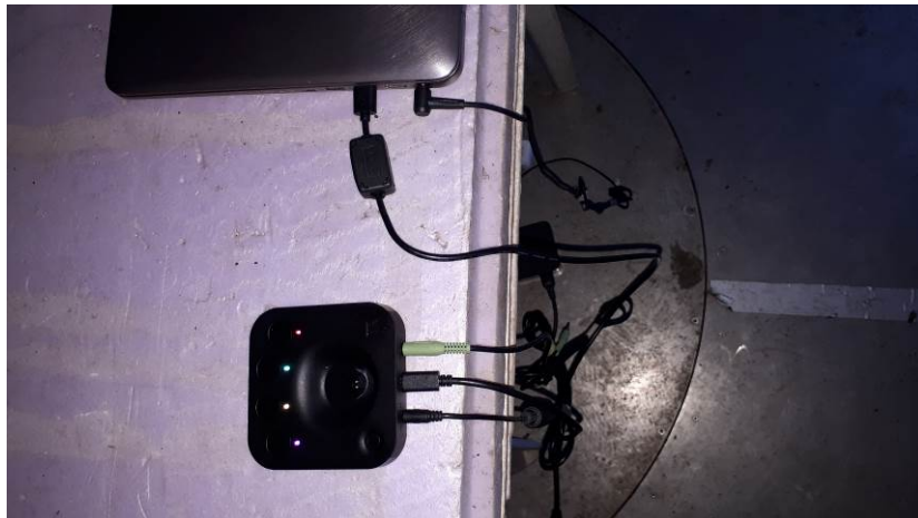
Open Area Test site (30M-1GHz)