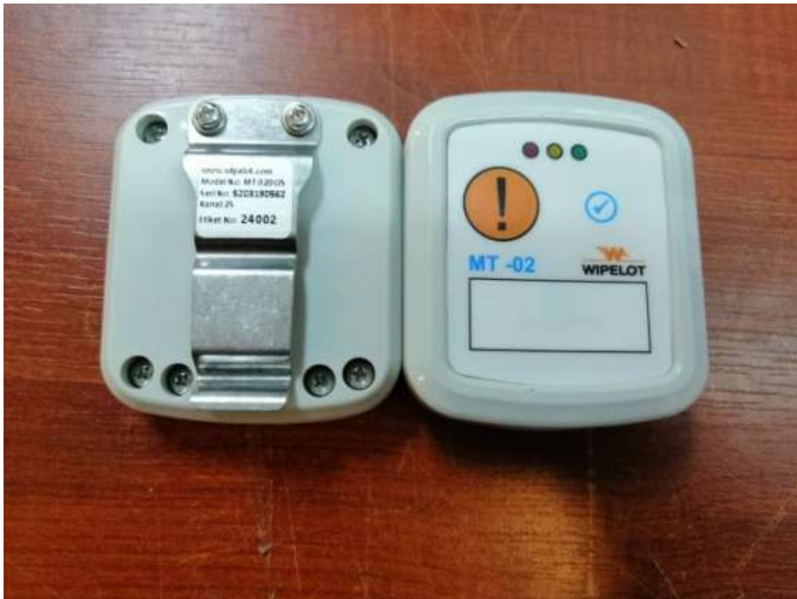
Figure 5: Wipelot MT-02DC Hardware Structure