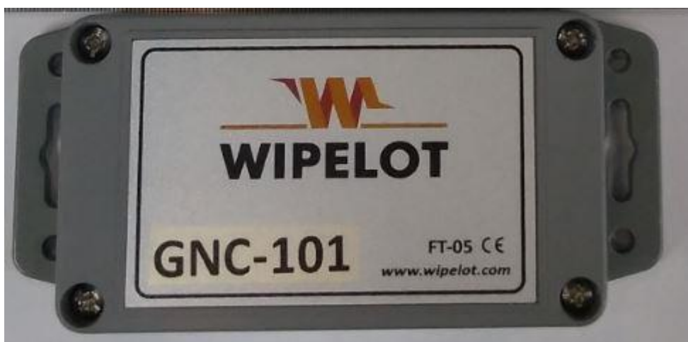
Figure 7: Wipelot FT-06FLC Collision Avoidance Anchor

Both the 2.4 GHz antenna and the UWB antenna are omnidirectional. Both antennas are permanent that's why It cannot be changed or reorient and relocate. The FT-06FLC can receive signals from every direction. If Wipelot FT-06FLC is obstructs by obstacle as depicted in Table 1, then the device's RF signal will decrease as stated in Table 1. FT-06FLC can transmit up to 100 meters to readers if RF output power is at max level (unobstructed).