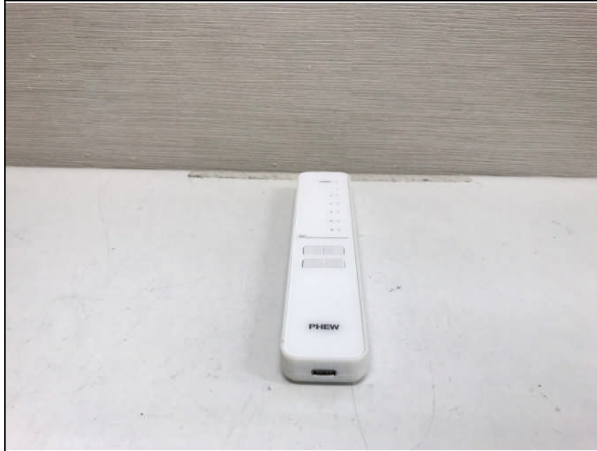
Rear view of EUT