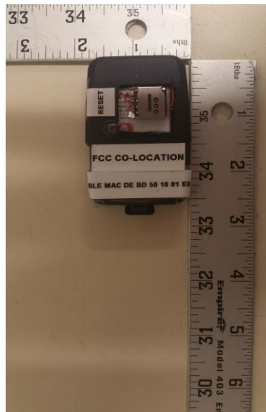
Figure C1. DUT top view