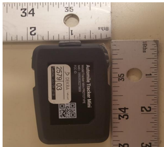
Figure C2. DUT rear view