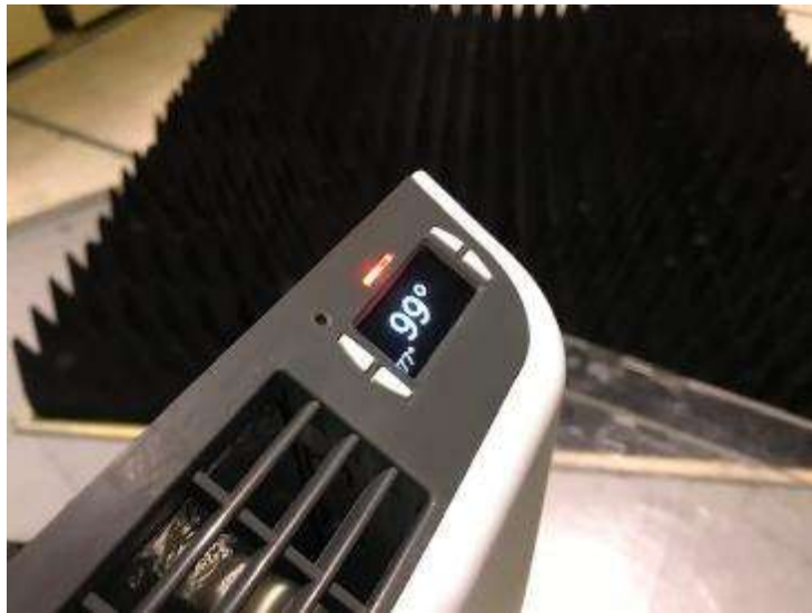
Location of transceiver and antenna is behind LCD display. This places the transceiver at the required 150 cm height.