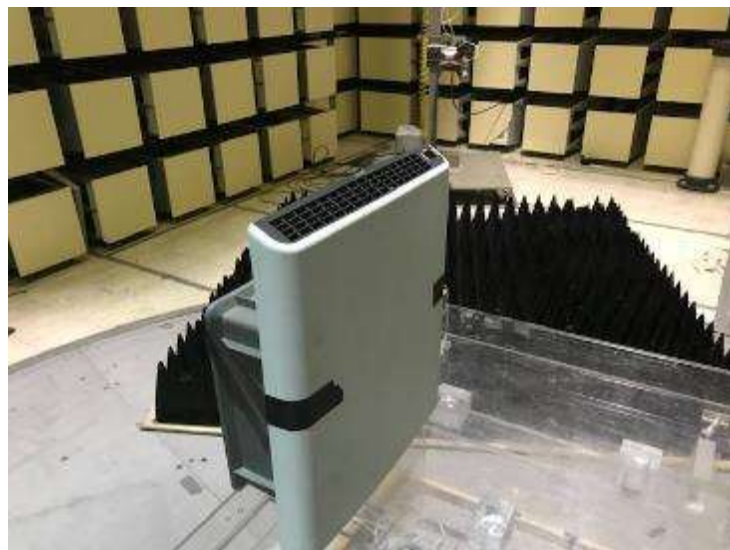
Radiated Emissions, 1 to 18 GHz