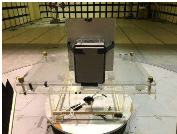
Radiated Emissions, Back, Below 1 GHz