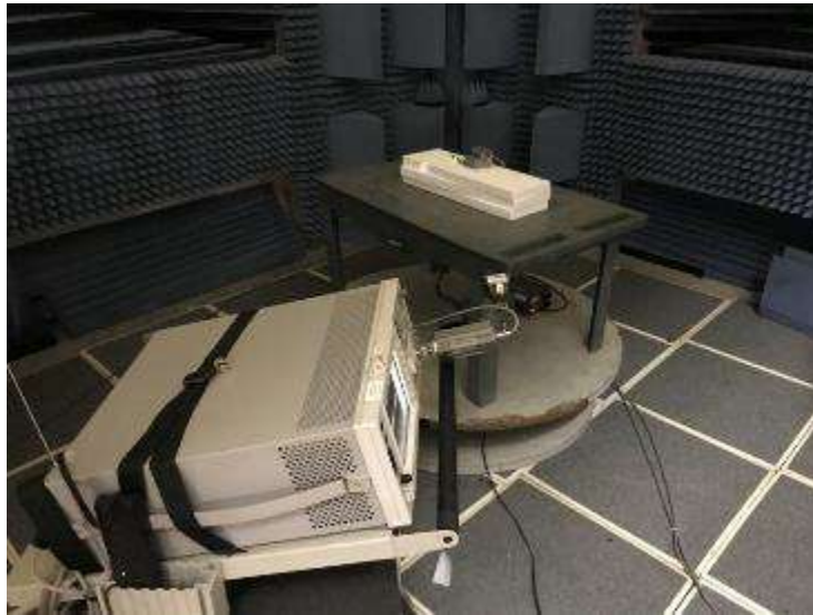
Radiated Emissions, 18 to 25 GHz