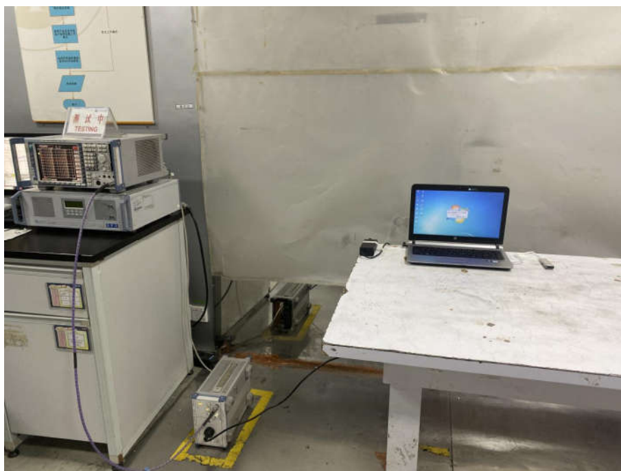
AC Conducted Emissions Test Setup