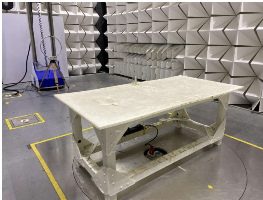
Radiated spurious emission Test Setup-1 (Below 30M)