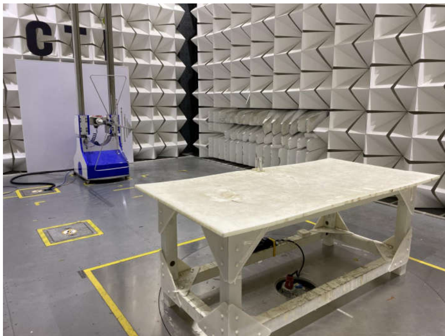
Radiated spurious emission Test Setup-2 (Below 1GHz)