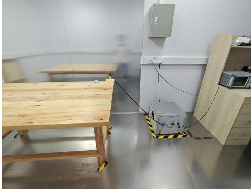
Radiated Spurious Emissions From 30MHz-1000MHz