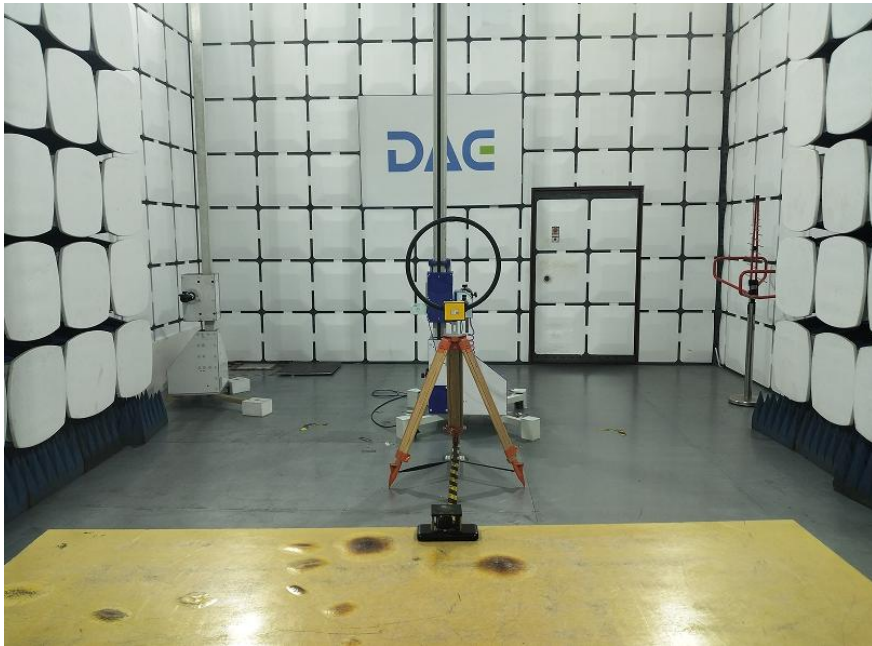
Emissions in frequency bands (30MHz - 1GHz)-TM1