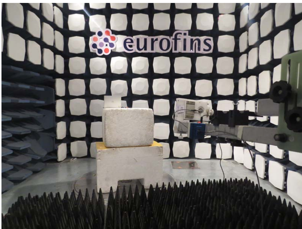
18GHz - 26.5GHz