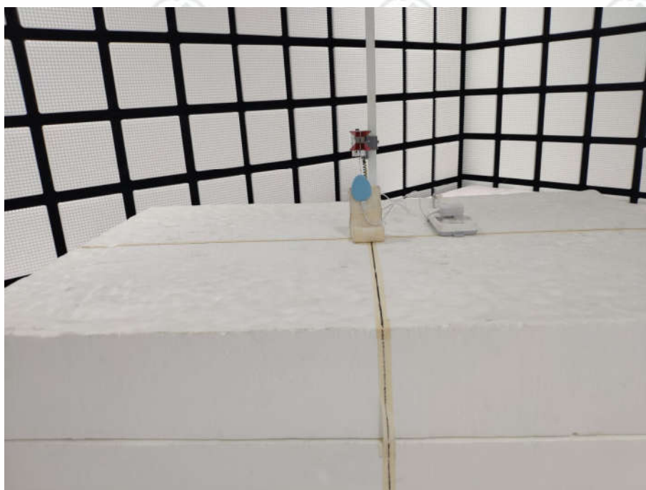
Radiated spurious emission Test Setup-2(Above 1GHz)