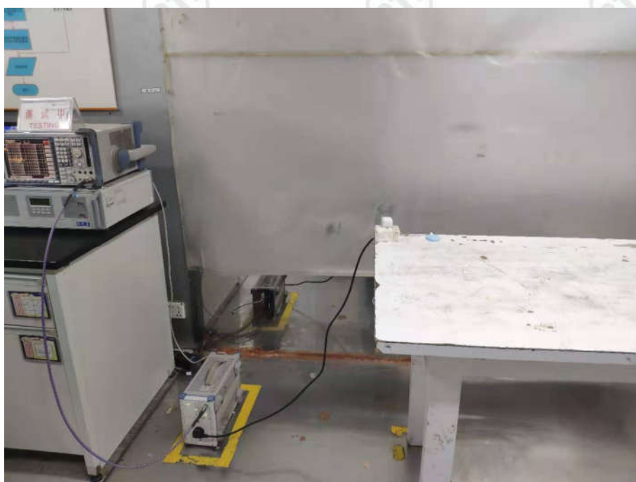
Conducted Emissions Test Setup