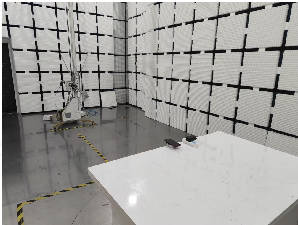
Radiated Emission below 1GHz-AC adapter charge mode