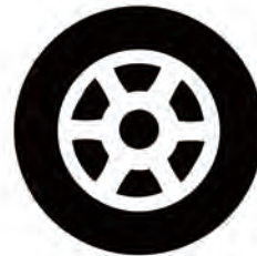
SMART BALANCE WHEEL

To maintain compliance with FCC's RF Exposure guidelines, This equipment should be installed and operated with minimum distance between 20cm the radiator your body: Use only the supplied antenna.