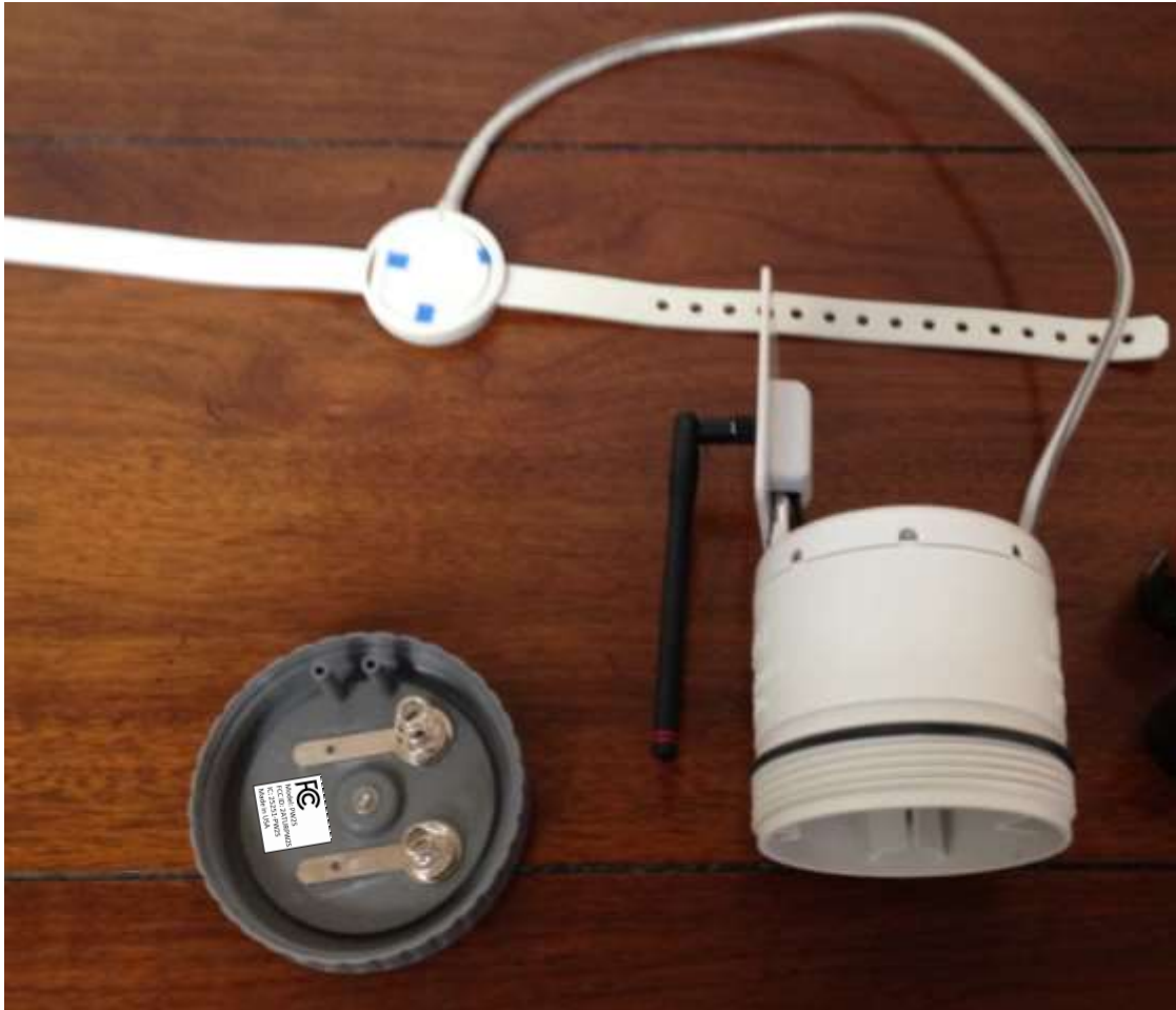
Fig. 1: SU regulatory label location and size. Label size: 0.75 by 0.75 inch.

The Sensor Unit (SU) will have a physical adhesive label displaying regulatory information. The label will be located inside the lid of the Battery Enclosure as shown in Figure 1. The size of the label will be 0.75 x 0.75 inches.