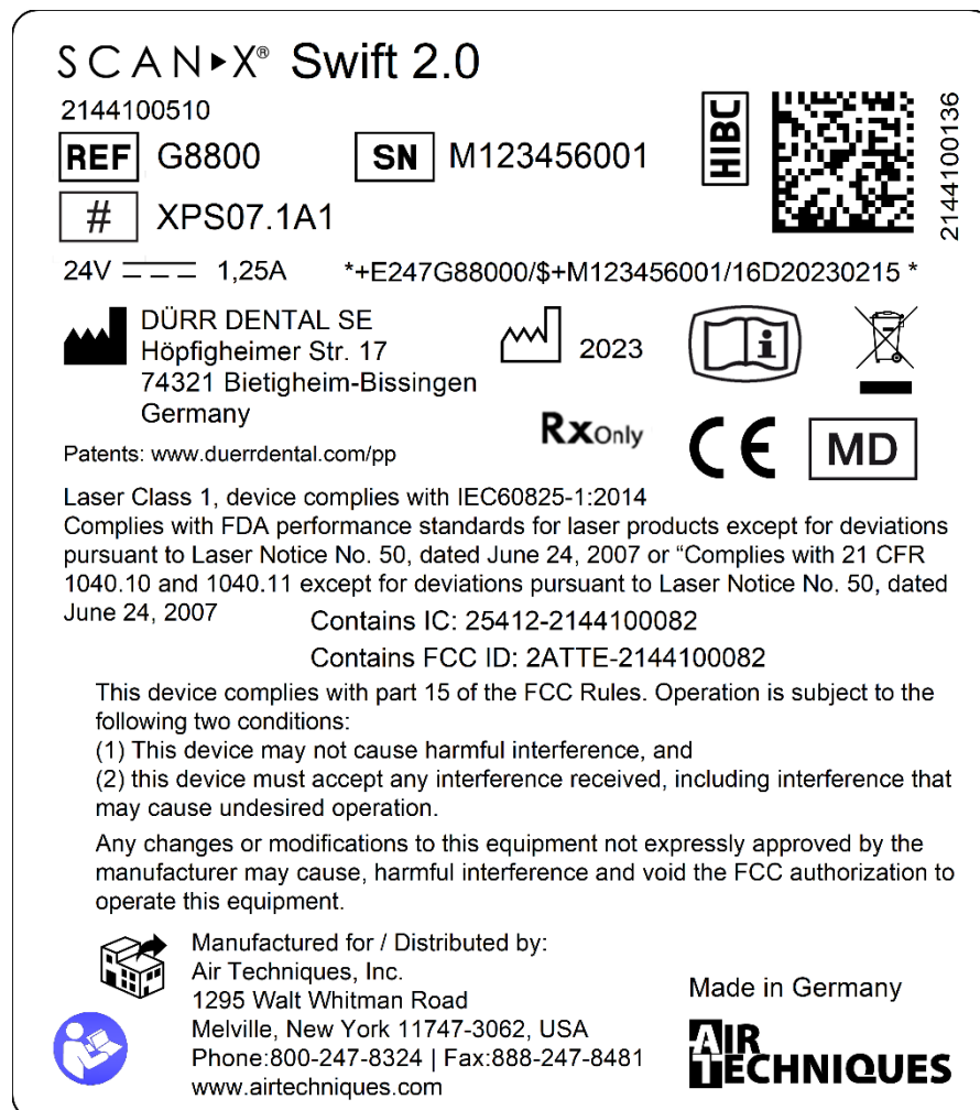
Figure 1: Host label from device variant XPS07.1A1

The RFID Modul 2144100082 will be used as a module e.g. in Intraoral Plate Scanners. The host label from the device variant XPS07.1A1 is shown in Figure 1 below: