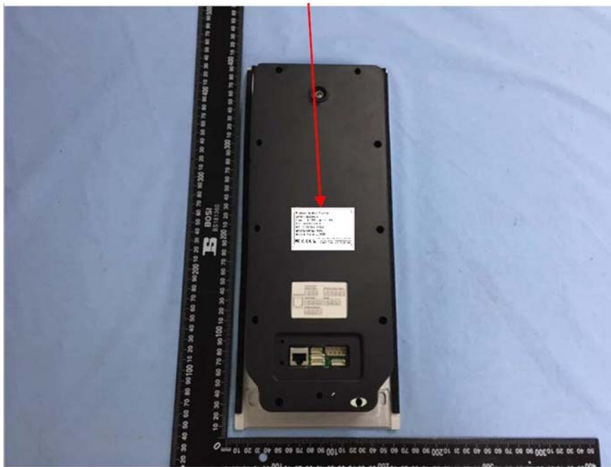
FCC ID Label Location