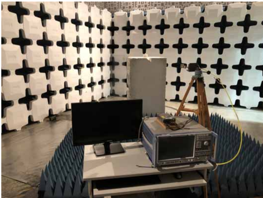
Test Setup for Spurious Radiated Emissions – 18GHz to 26.5GHz, Vertical Polarization