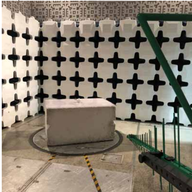
Test Setup for Spurious Radiated Emissions – 30MHz to 1GHz, Vertical Polarization