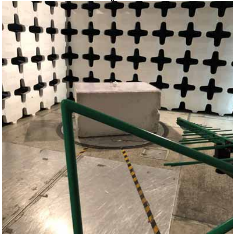
Test Setup for Spurious Radiated Emissions – 30MHz to 1GHz, Horizontal Polarization