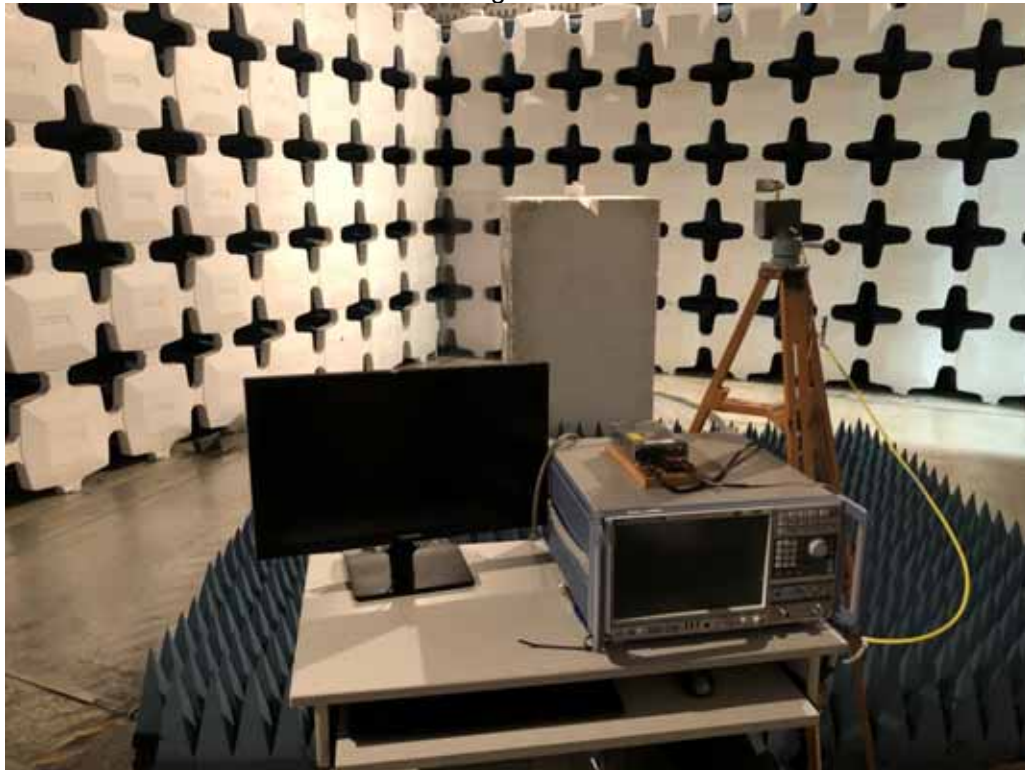
Test Setup for Spurious Radiated Emissions – 18GHz to 26.5GHz, Horizontal Polarization