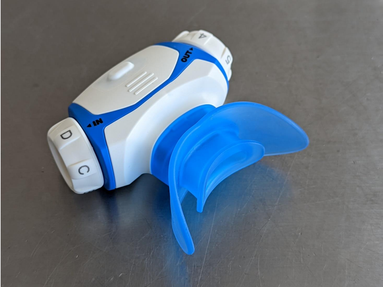
AF003 External mounted on Passive Unit (2)