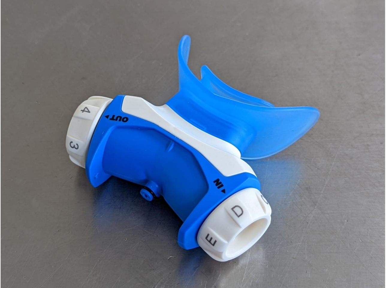
AF003 External Passive Unit (no electronics) (2)