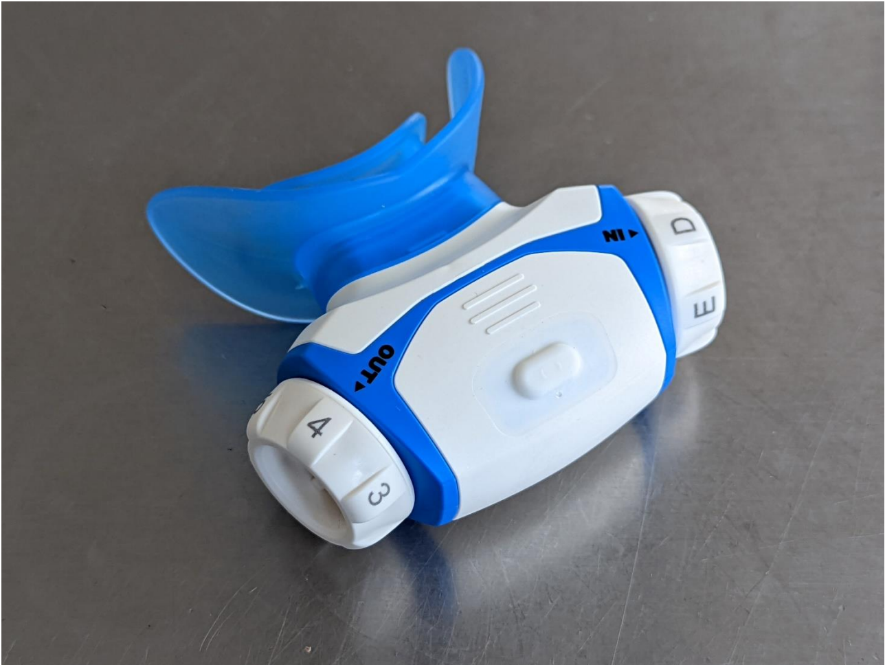
AF003 External mounted on Passive Unit (1)