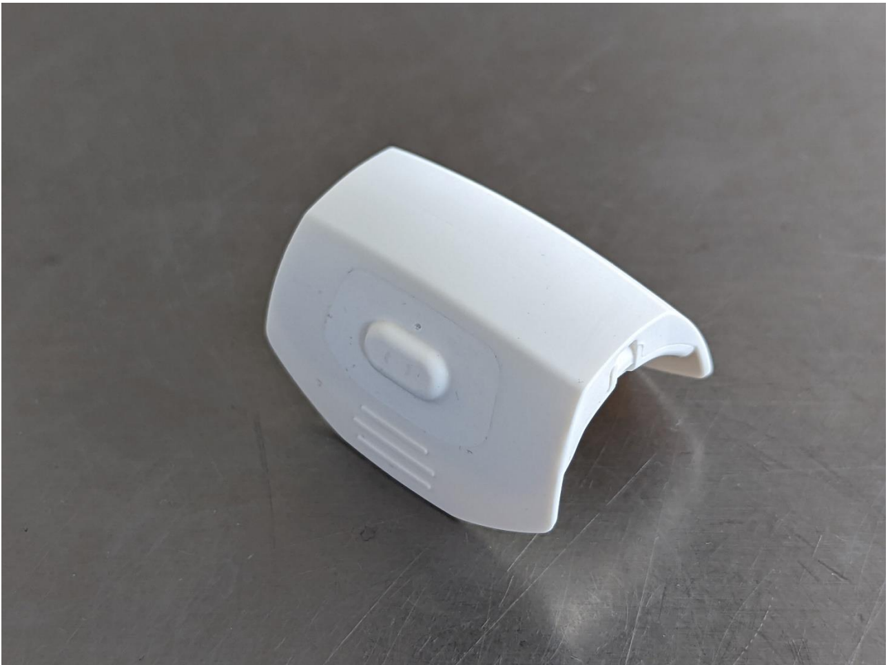
AF003 External (1)