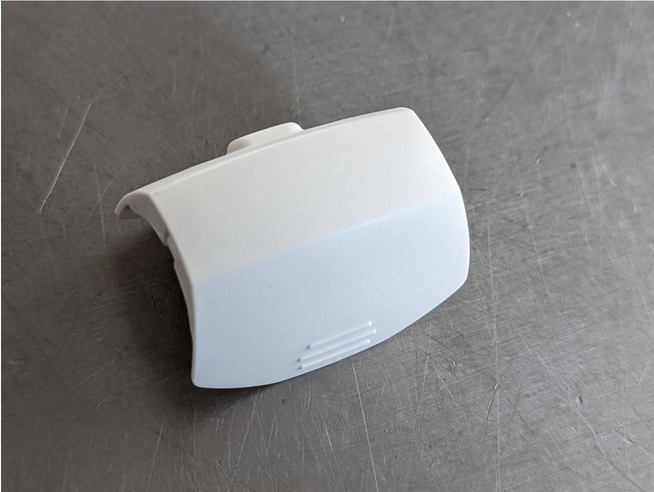
AF003 External (2)