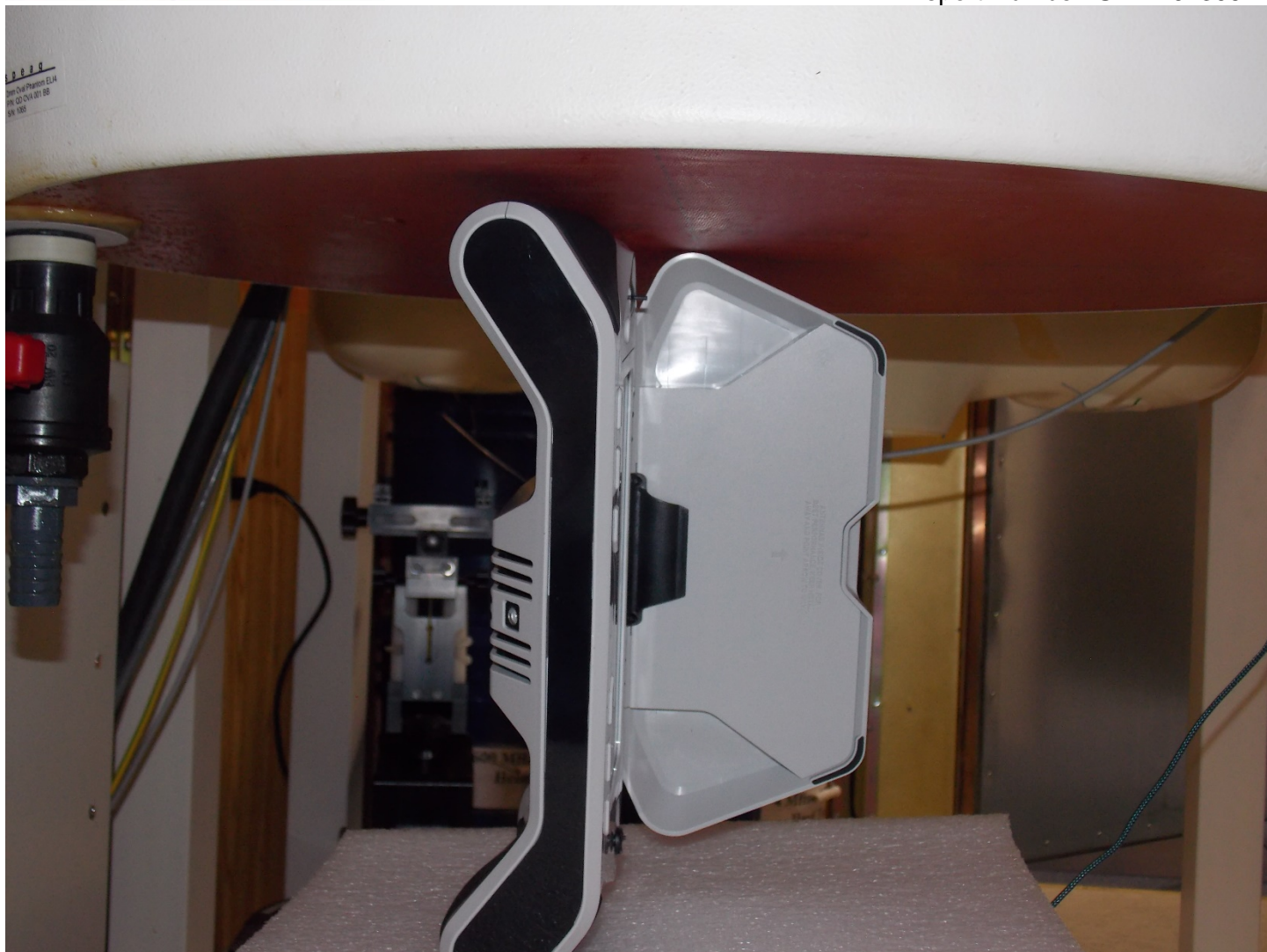
Test Position Left 0 mm Gap