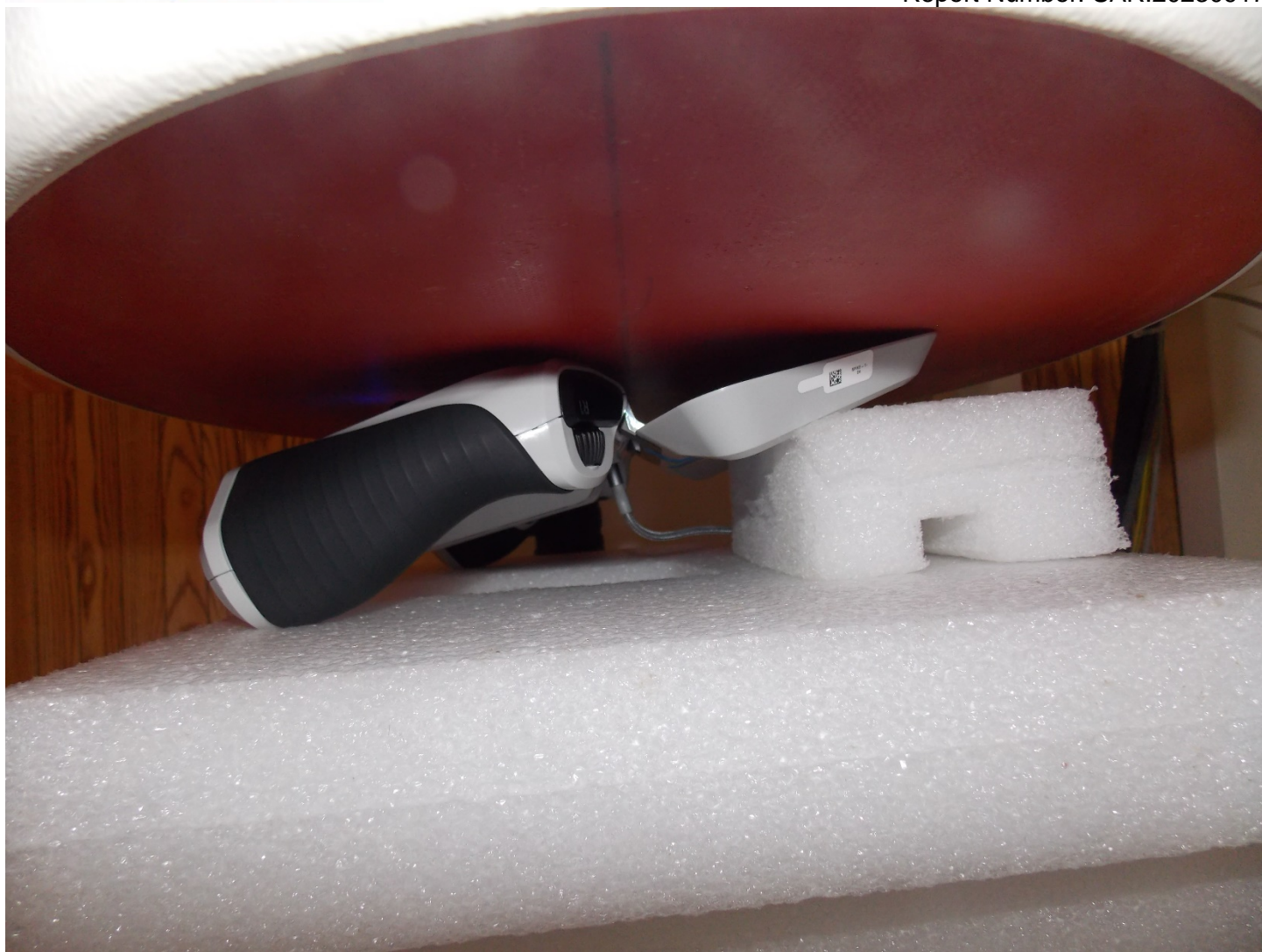
Test Position Front 0 mm Gap