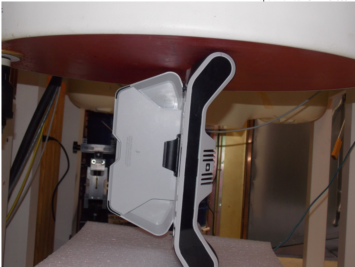
Test Position Right 0 mm Gap