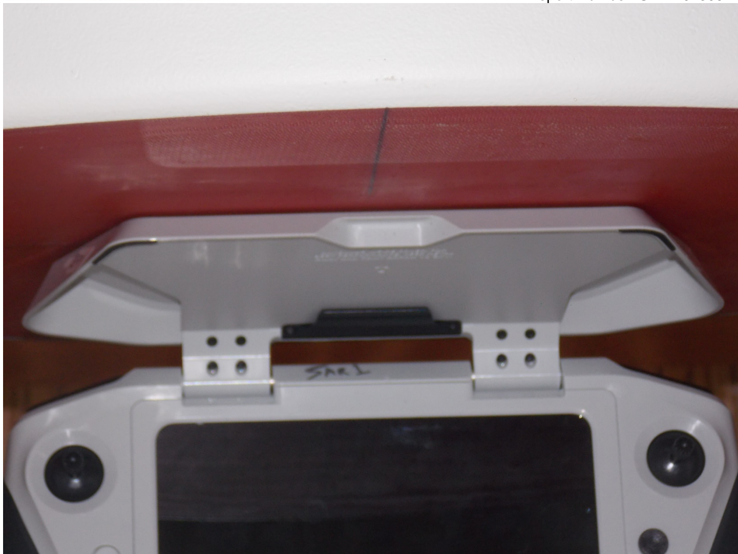
Test Position Back (Front View) 0 mm Gap