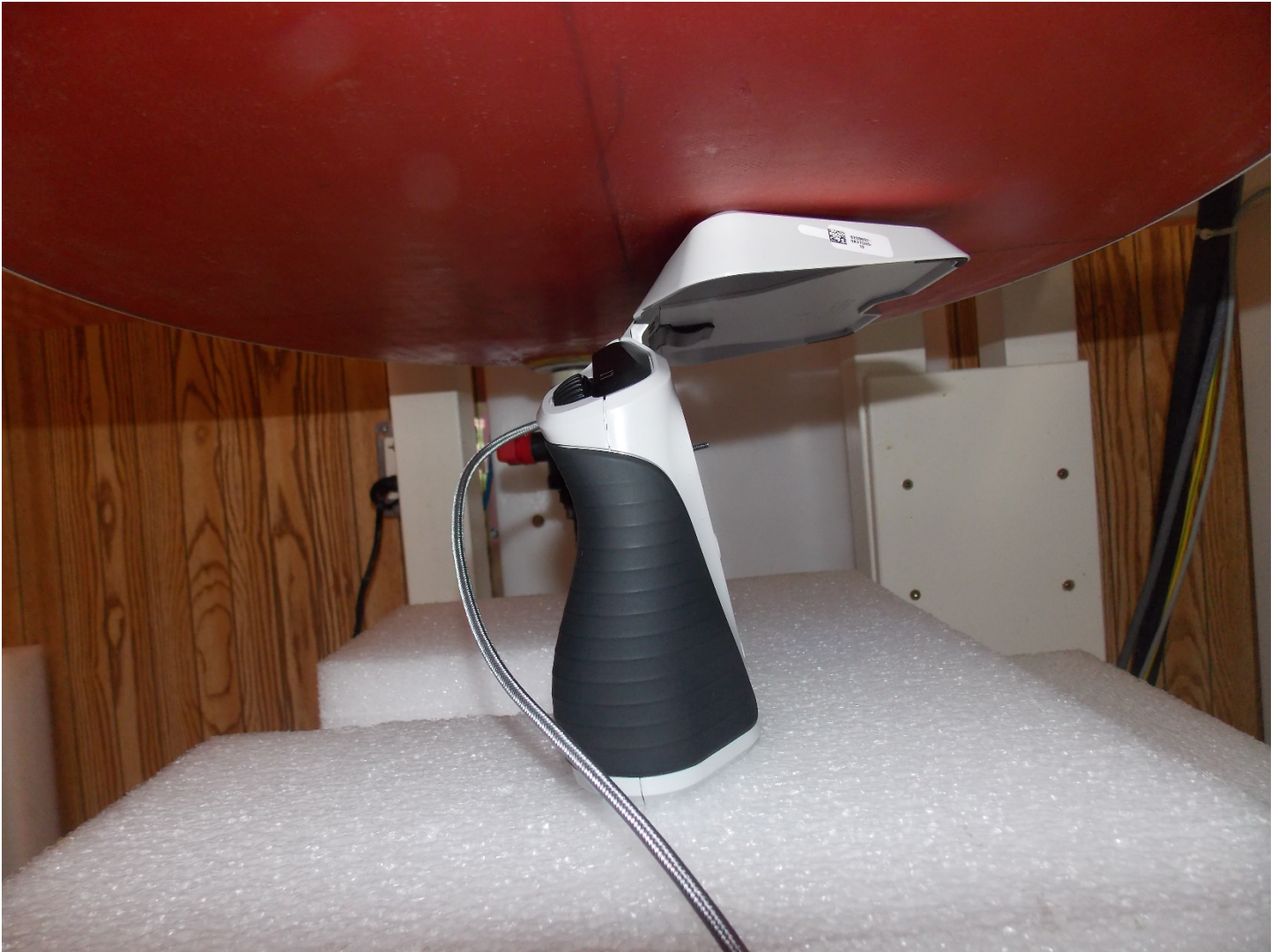
Test Position Back 0 mm Gap