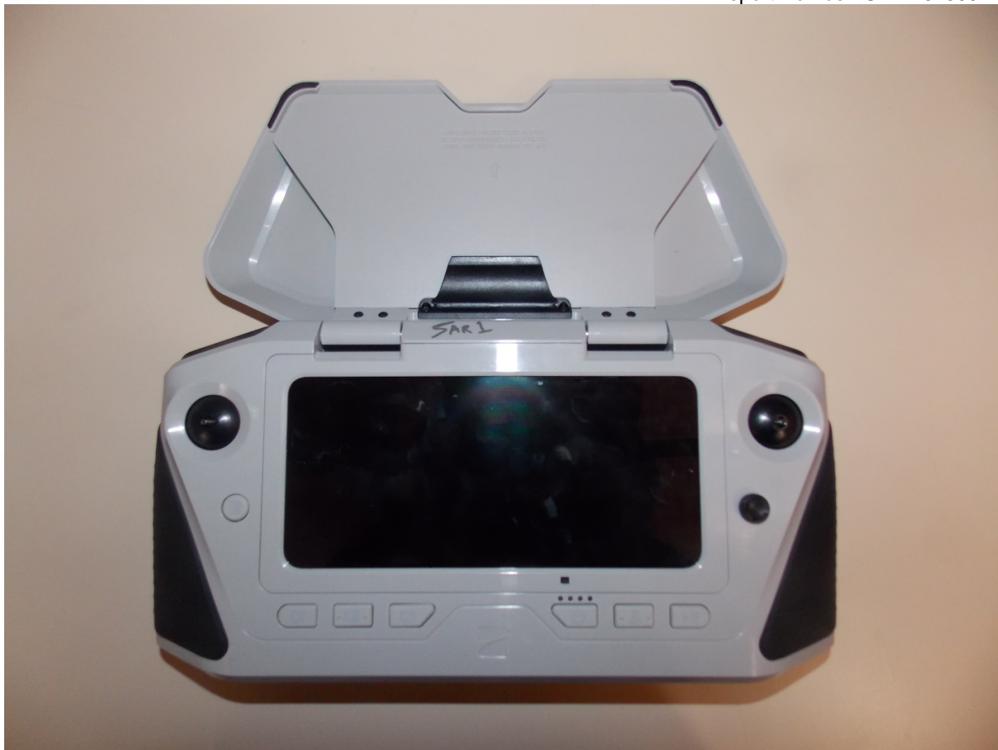
Front of Device