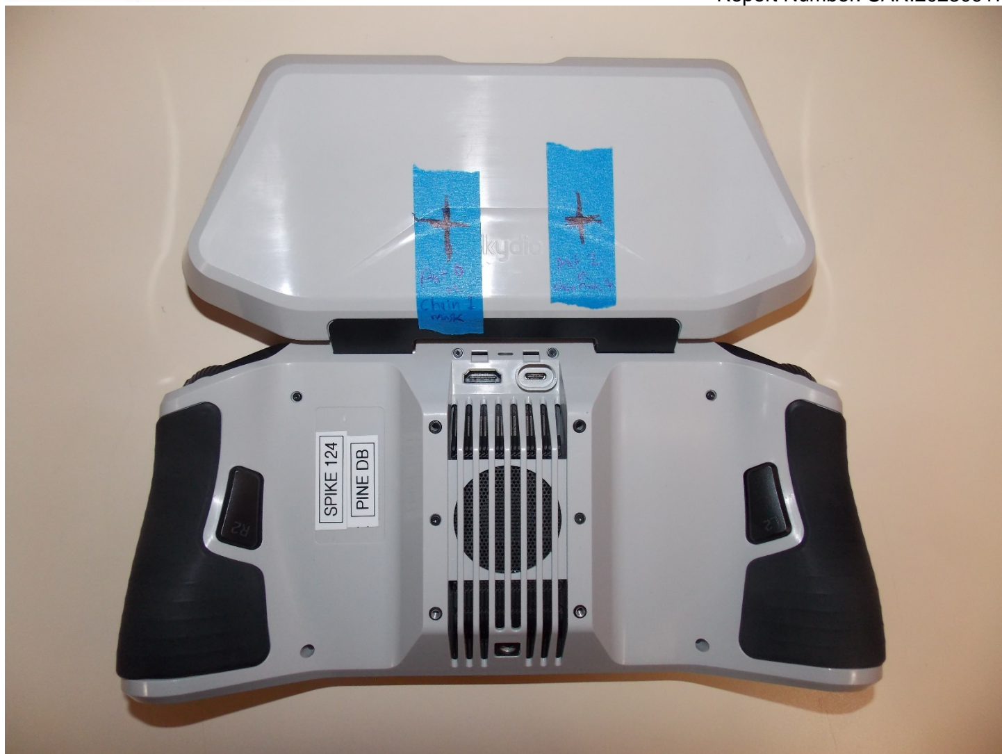
Back of Device