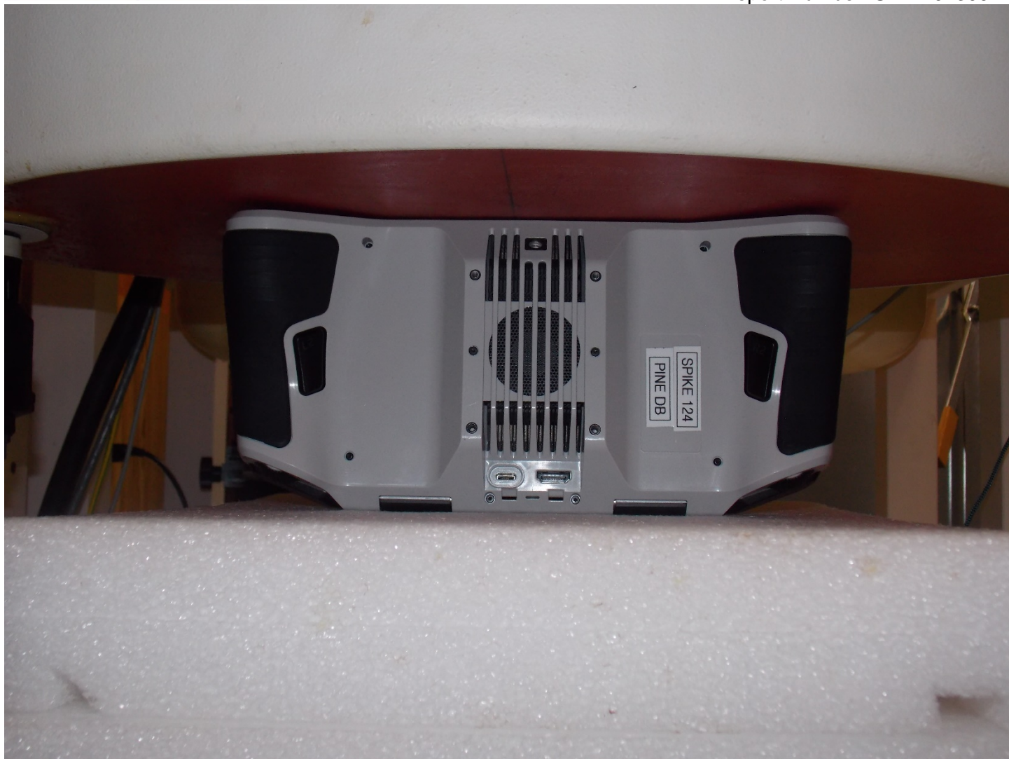
Test Position Bottom 0 mm Gap