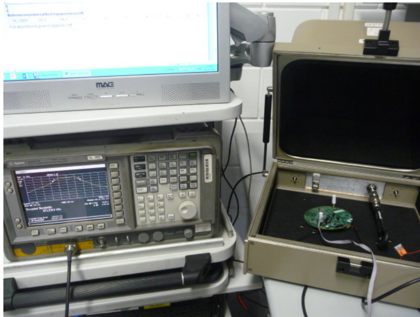
Photograph No.1 Setup for OBW measurements