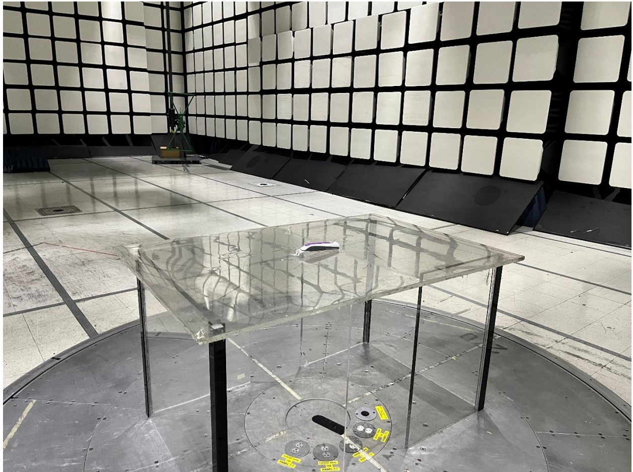
Radiated Emissions Above 30MHz