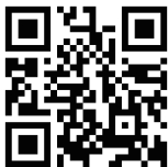
"T9 Translator" APP

1.Scanning the QR code to download and install "T9 Translator" APP .