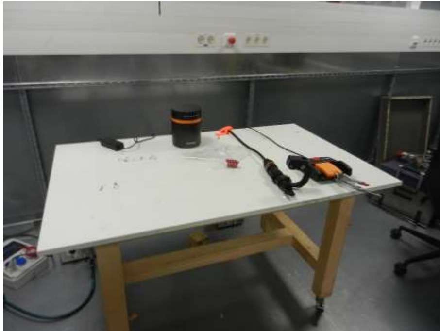
Conducted AC emissions