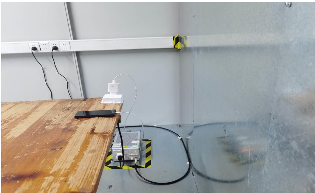
Conducted Emissions with AC Ports