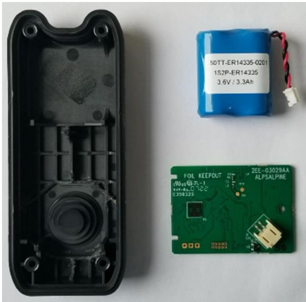
Figure 1: Skoll Component Parts Photo.