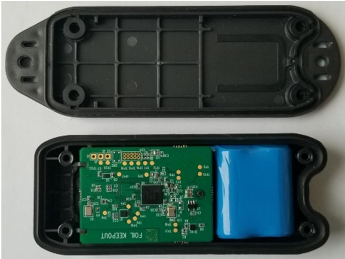
Figure 2: Skoll Internal Cover and Panel Photo.