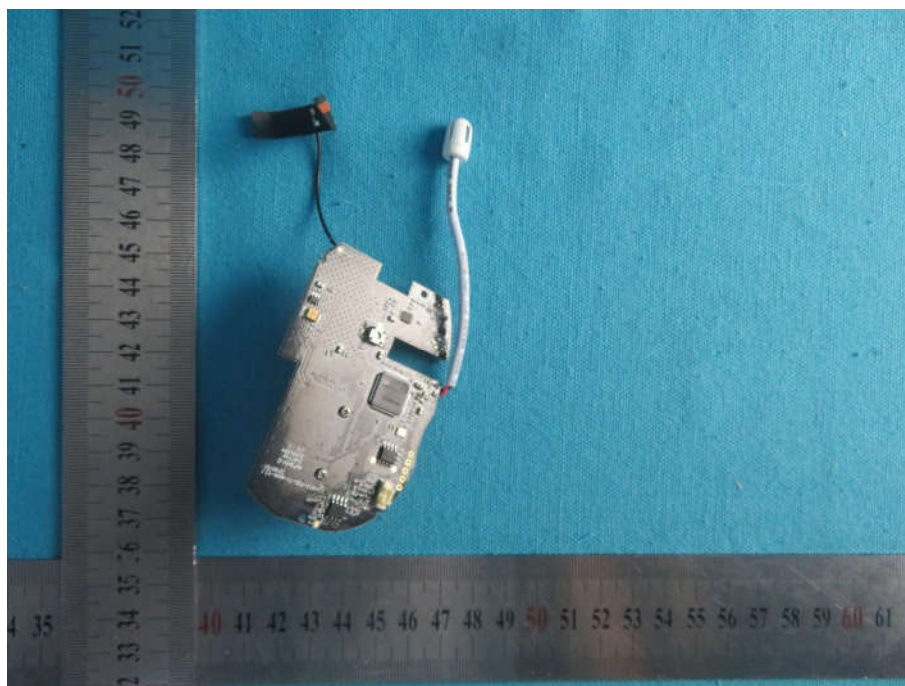
View of Product-11