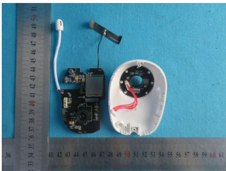
View of Product-10