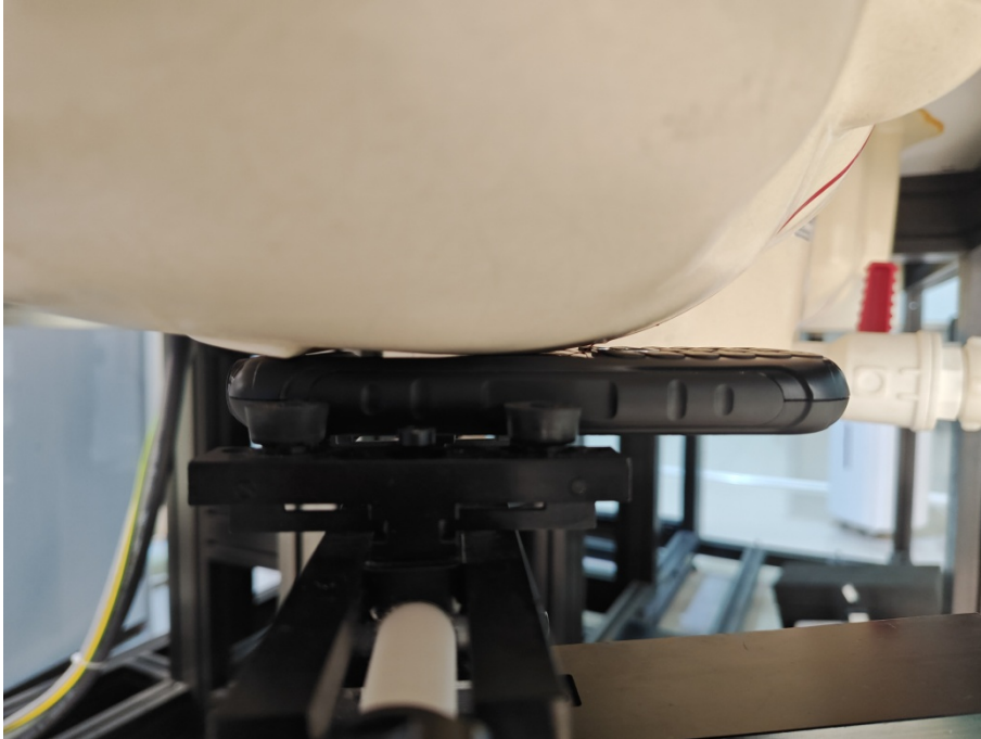
Head Right Tilt Setup Photo (0mm)