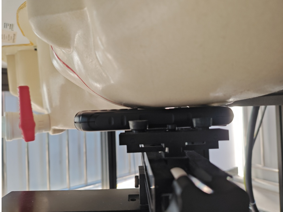
Head Left Tilt Setup Photo (0mm)