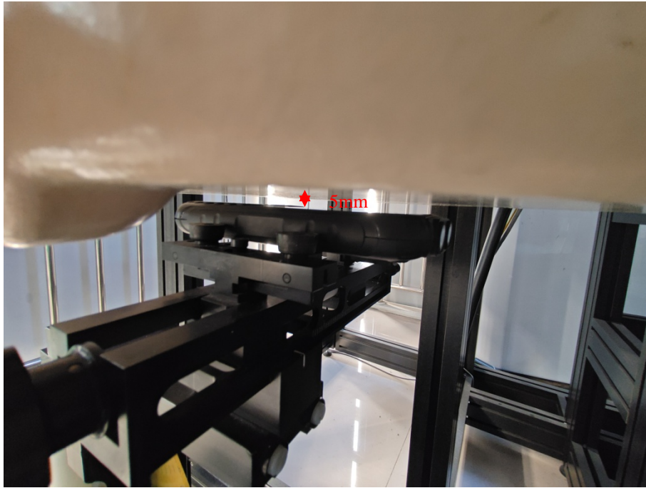
Body(Wron) Back Setup Photo (5mm)