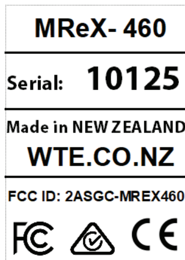
Figure 2: MReX Unit Label