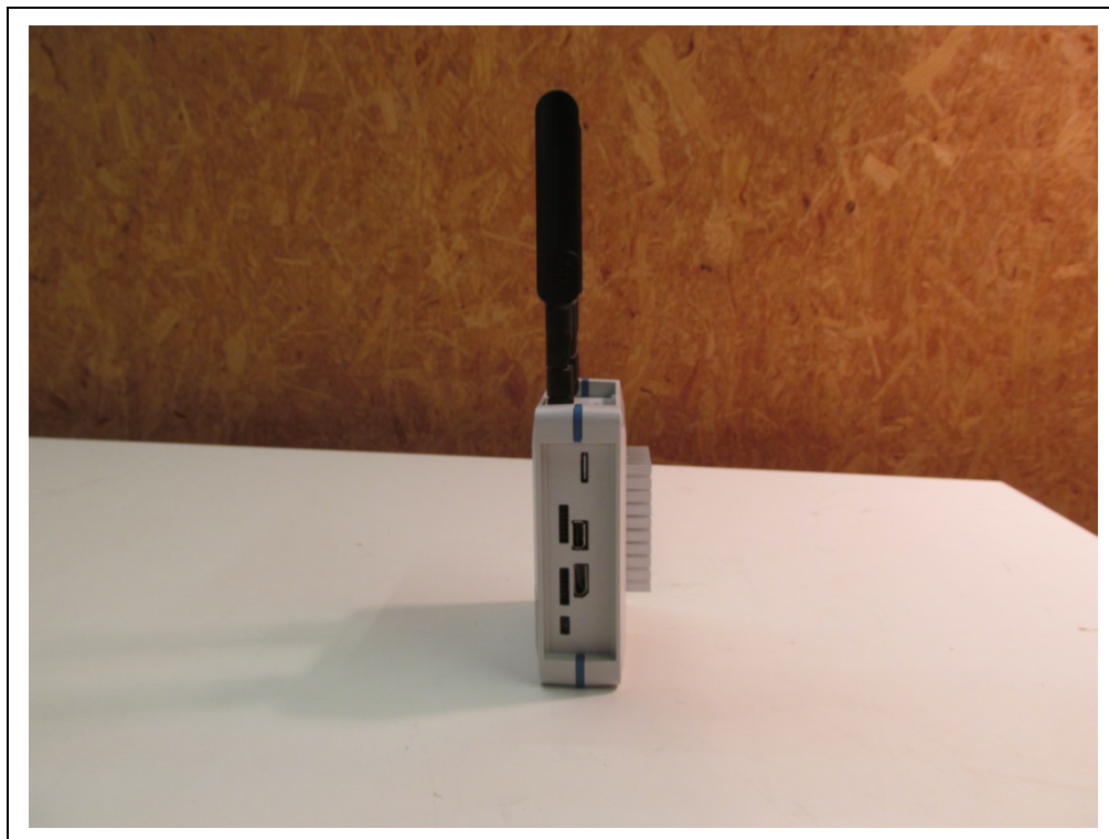
Photograph A2-3: EUT left side

Test on MYNXG Product GmbH 110012 to 47 CFR § 15.247 and KDB 558074 D01 15.247 Meas Guidance v05r02