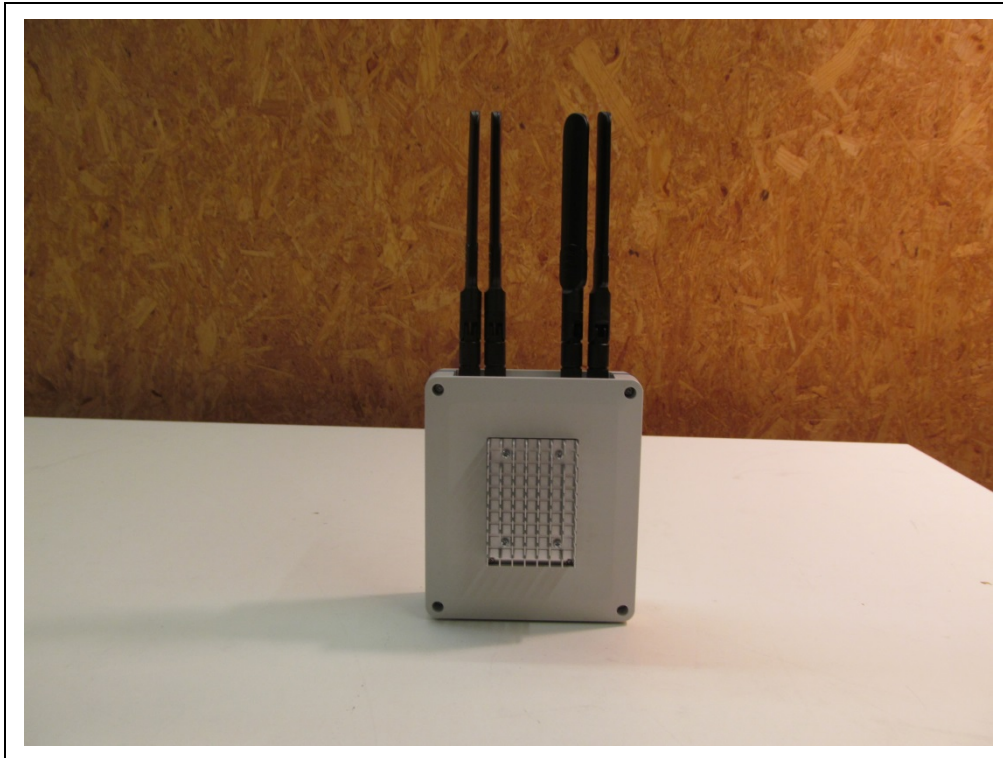
Photograph A2-1: EUT front side

Test on MYNXG Product GmbH 110012 to 47 CFR § 15.247 and KDB 558074 D01 15.247 Meas Guidance v05r02