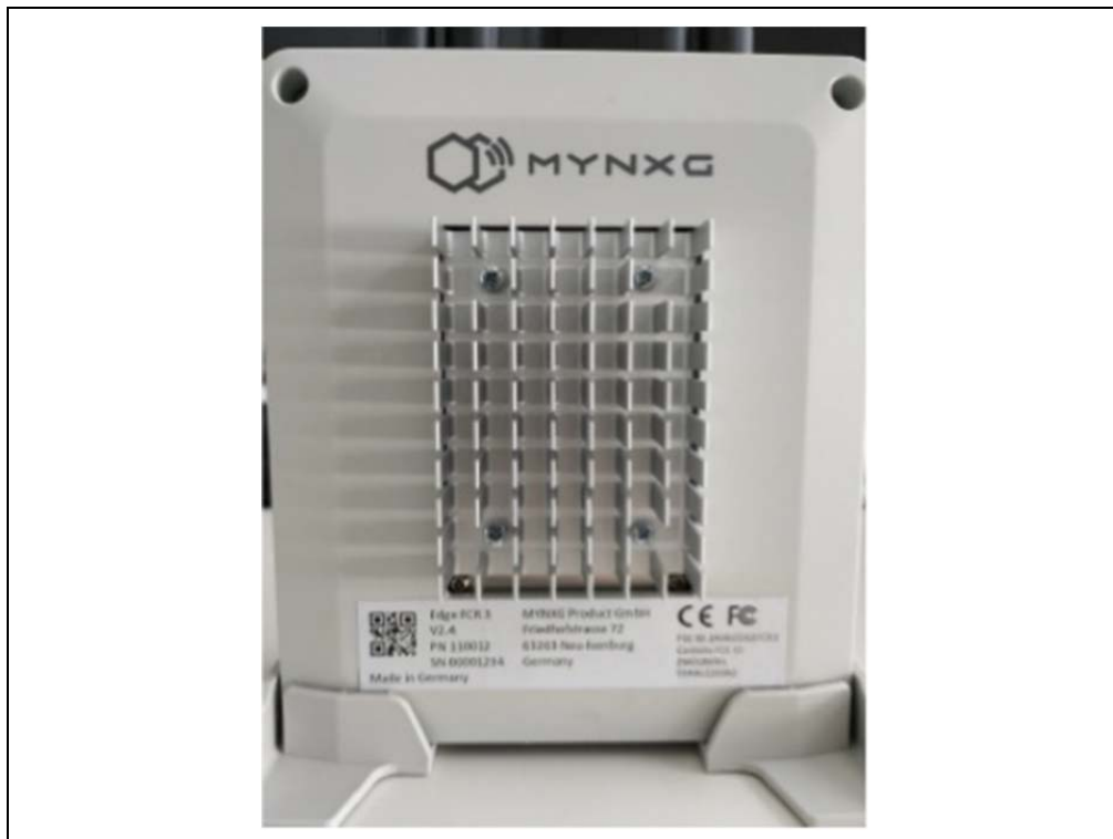
Photograph A2-8: Edge FCR 3 front-view with product label

Picture shows preliminary product number.