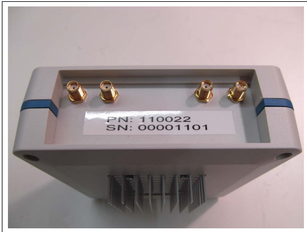
Photograph A2-7: EUT Label

Test on MYNXG Product GmbH 110012 to 47 CFR § 15.247 and KDB 558074 D01 15.247 Meas Guidance v05r02