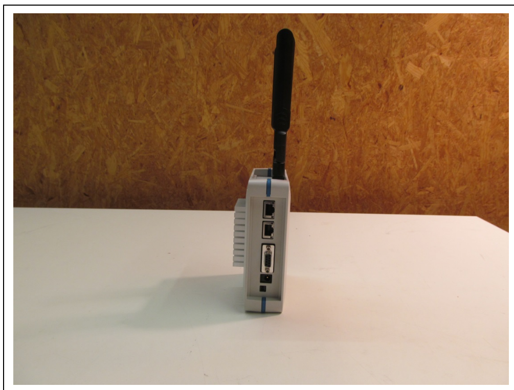
Photograph A2-4: EUT right side