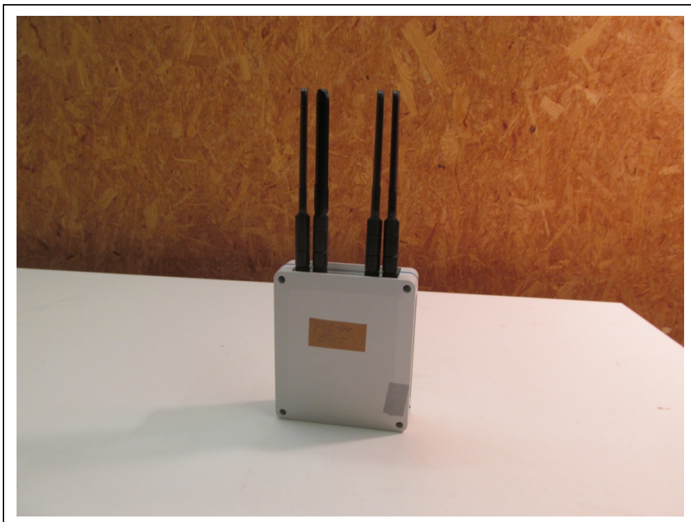
Photograph A2-2: EUT back side

The brown paper tape on the back side of the housing was used to identify the EUT during measurements. It is not part of the device.