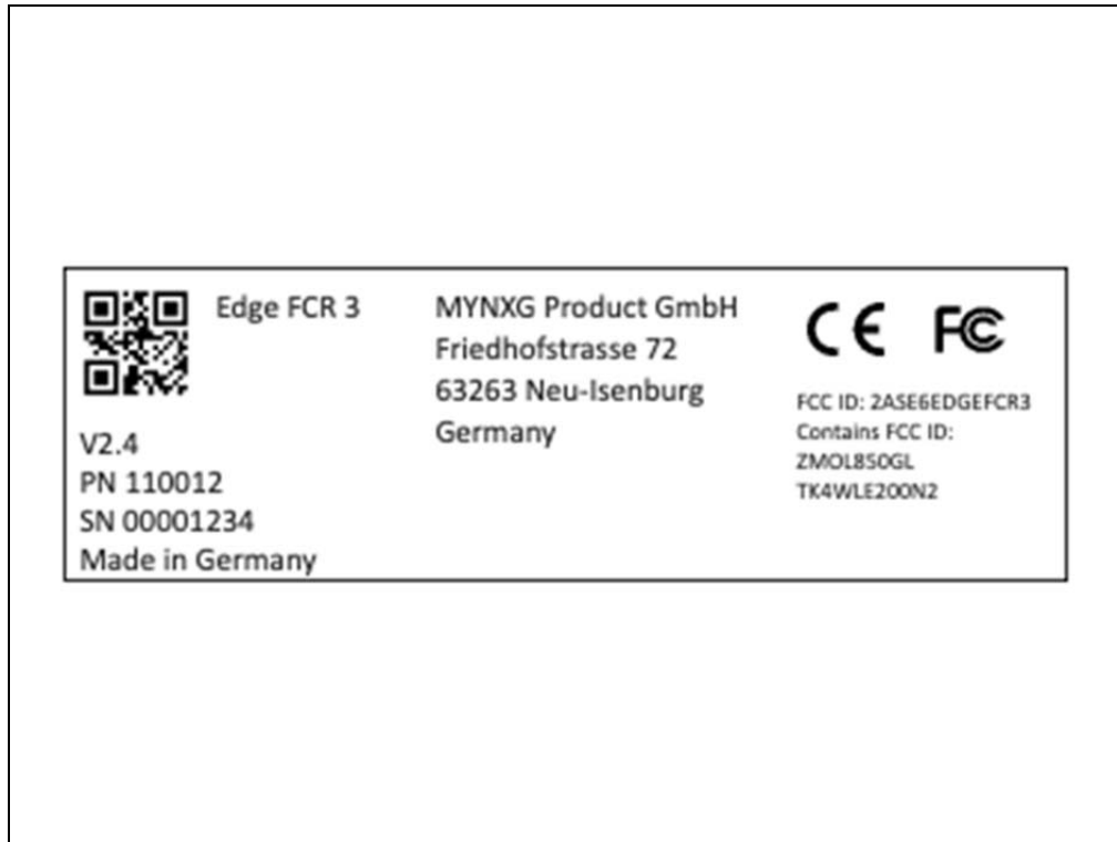
Photograph A2-9: Edge FCR3 product label

Test on MYNXG Product GmbH 110012 to 47 CFR § 15.247 and KDB 558074 D01 15.247 Meas Guidance v05r02