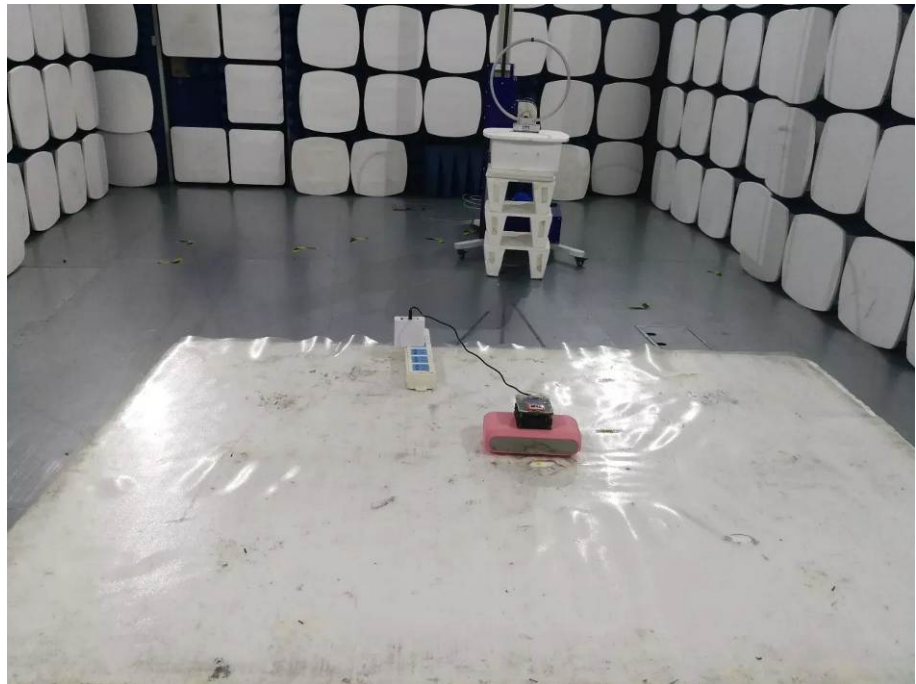
Radiated emission – above 30MHz