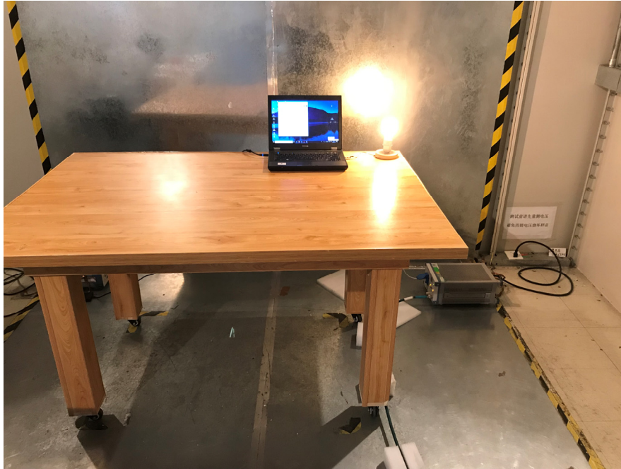
Conducted Emissions - Rear Side