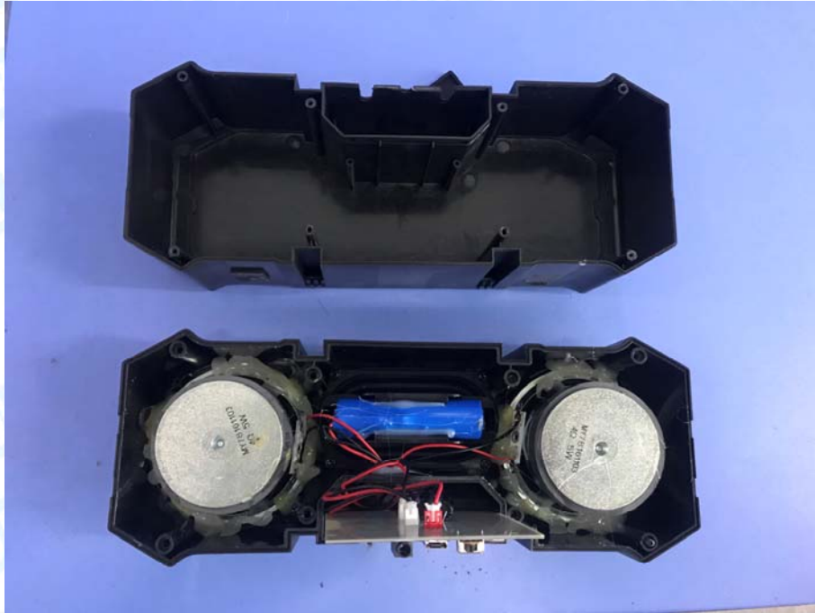
Photo 10 Internal of PCB