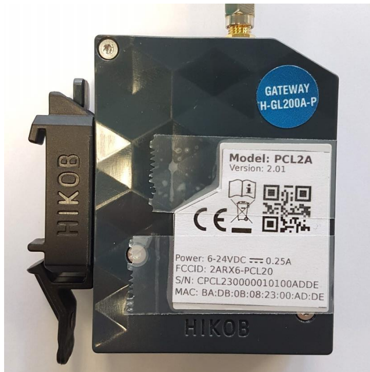
Figure 3: Example for the GATEWAY H-GL201A-P model